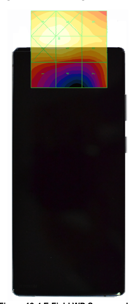
Figure 18-4 E-Field WD Scan overlay