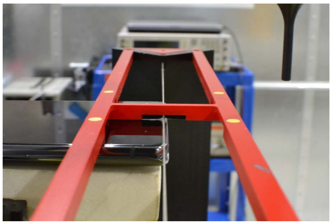
Figure 18-2 HAC Phantom Plane Alignment