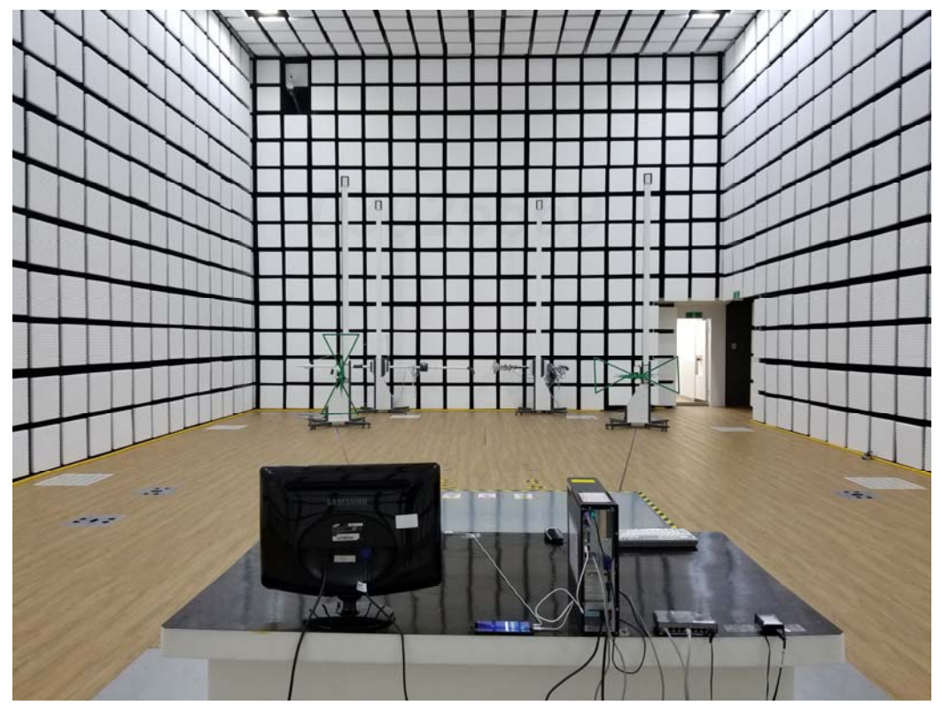
[Radiated Disturbance for Below 1 GHz – Rear]