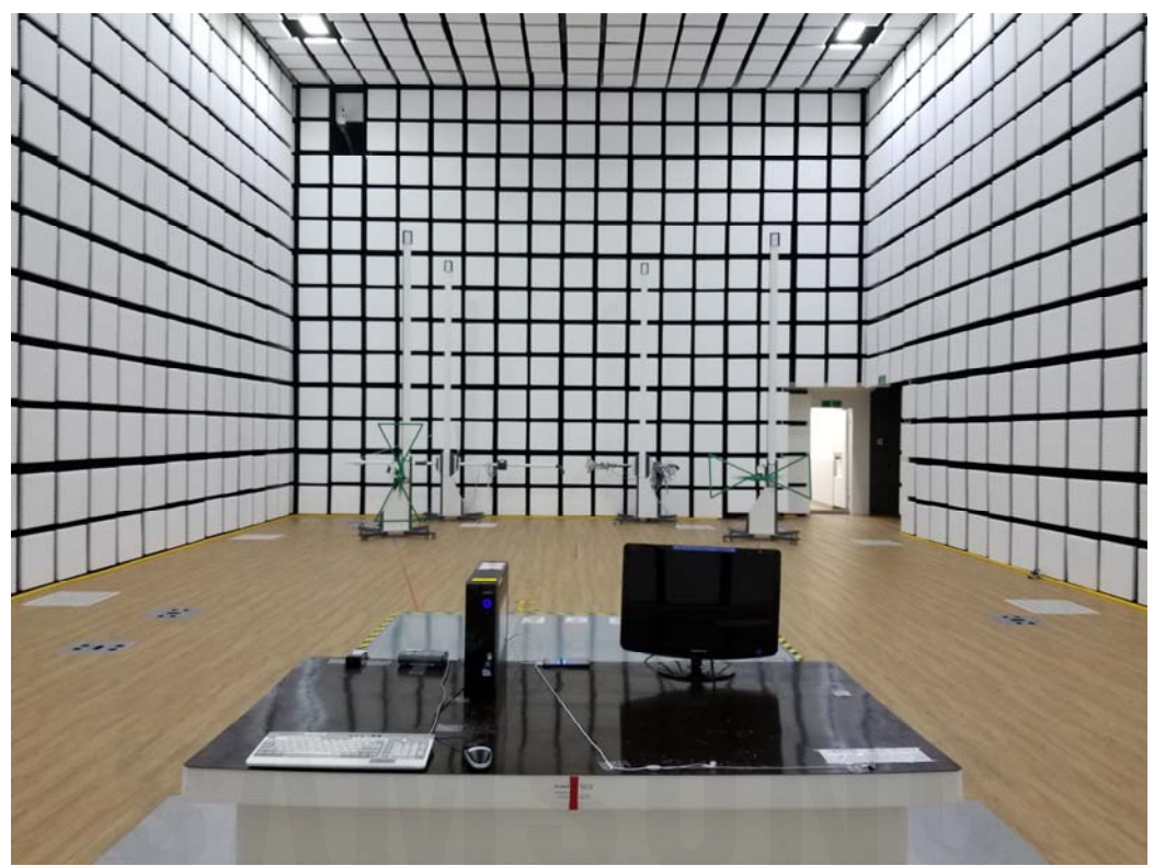
[Radiated Disturbance for Below 1 GHz – Front]