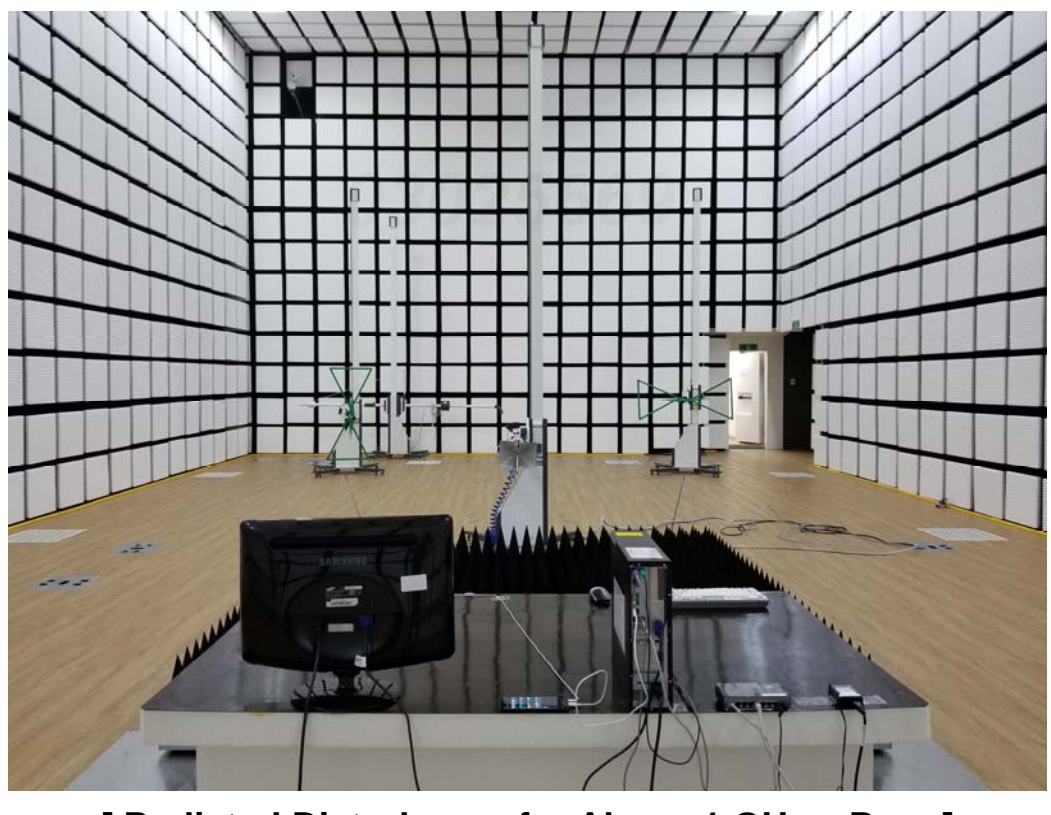
[Radiated Disturbance for Above 1 GHz – Rear]