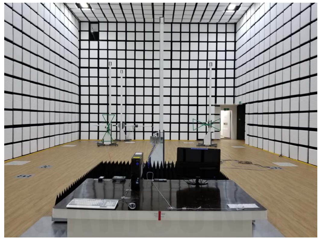
[Radiated Disturbance for Above 1 GHz – Front]