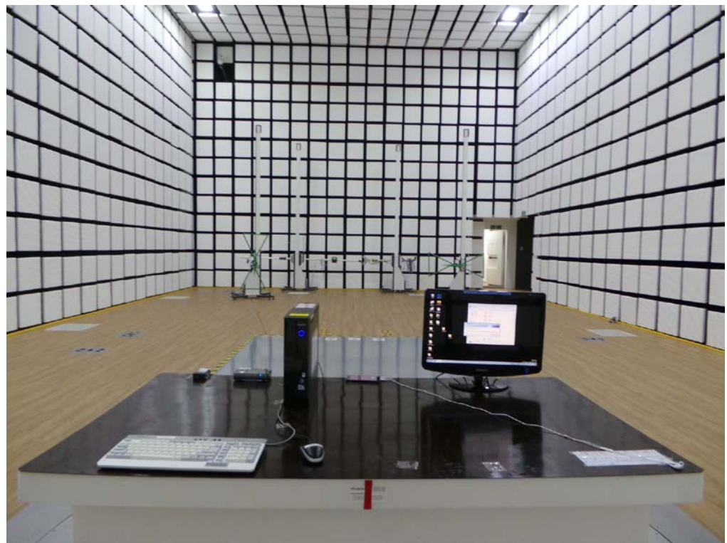
[Radiated Disturbance for Below 1 GHz – Front]