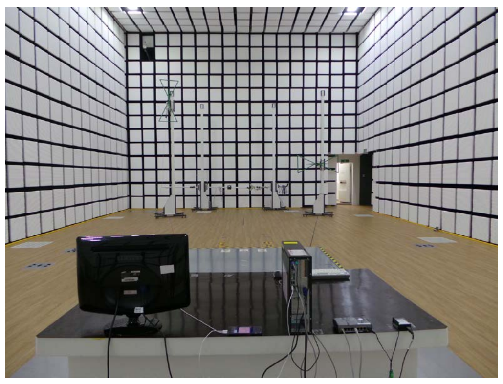
[Radiated Disturbance for Below 1 GHz – Rear]