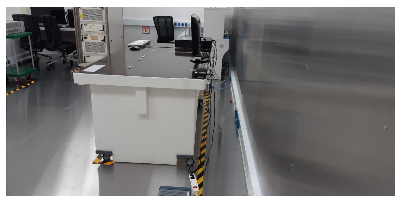
[ Conducted Disturbance – Rear ]