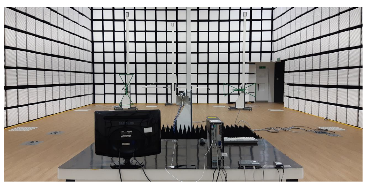
[ Radiated Disturbance for Above 1 GHz – Rear ]