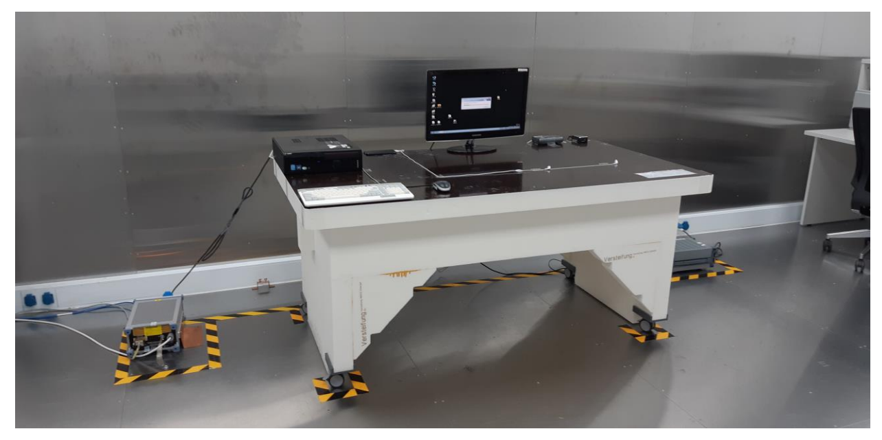
[ Conducted Disturbance – Front ]