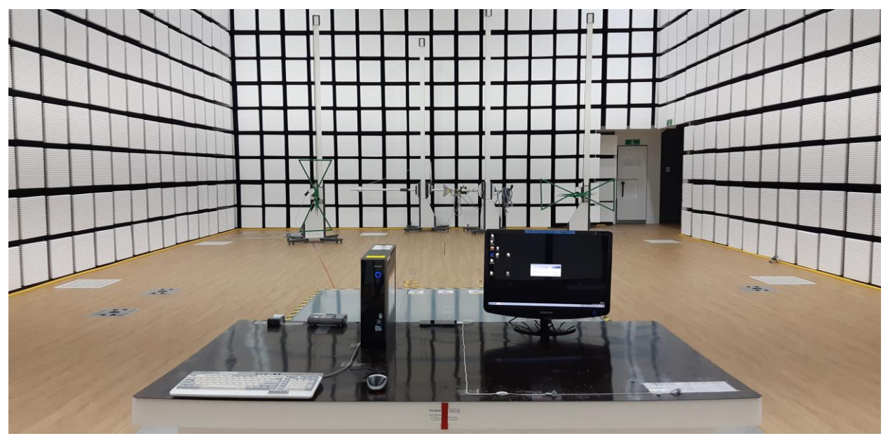
[ Radiated Disturbance for Below 1 GHz - Front ]