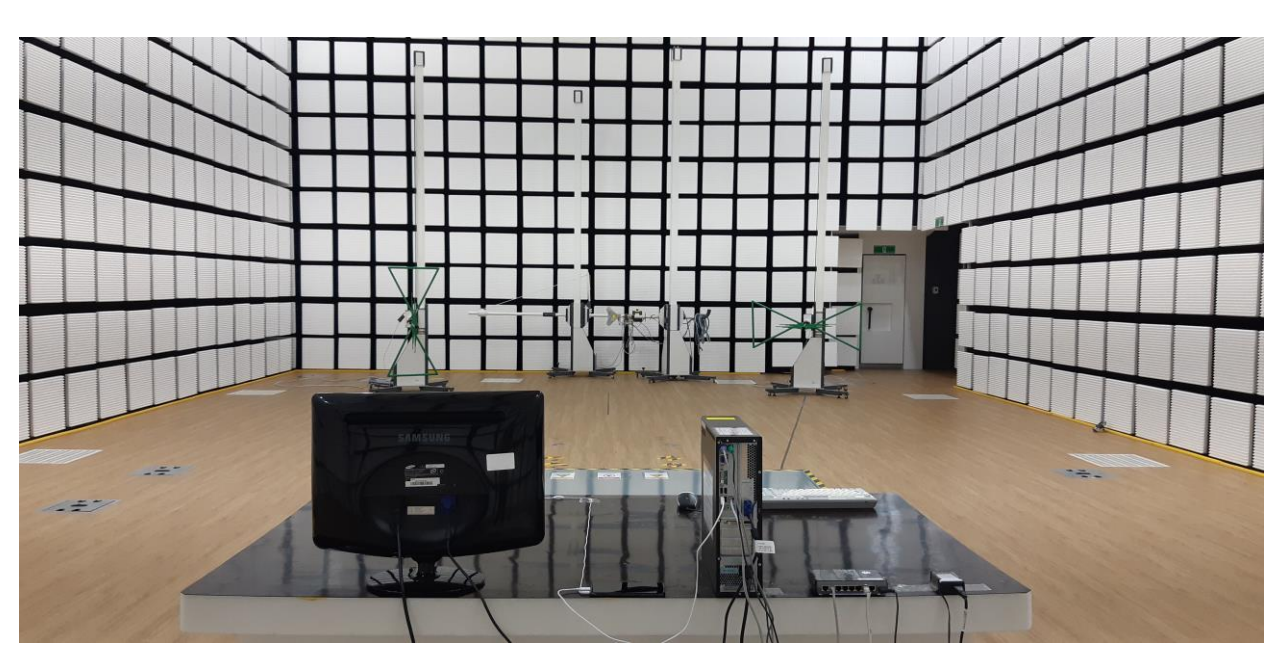
[ Radiated Disturbance for Below 1 GHz – Rear ]