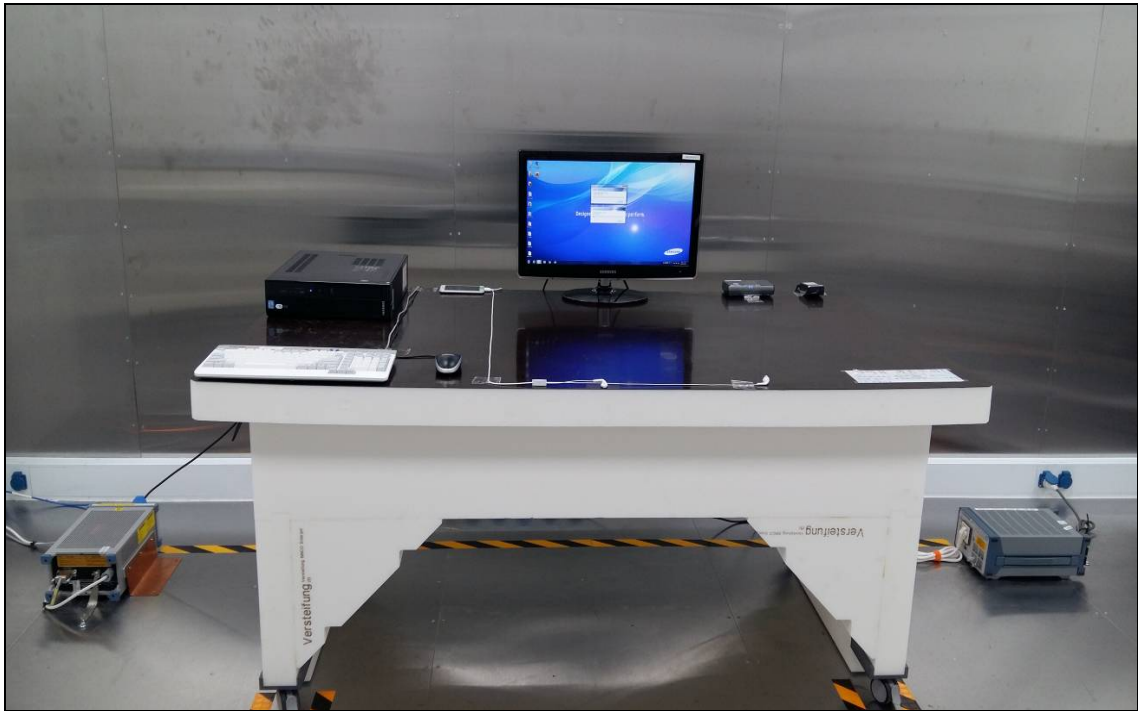
[ Conducted Disturbance – Front ]