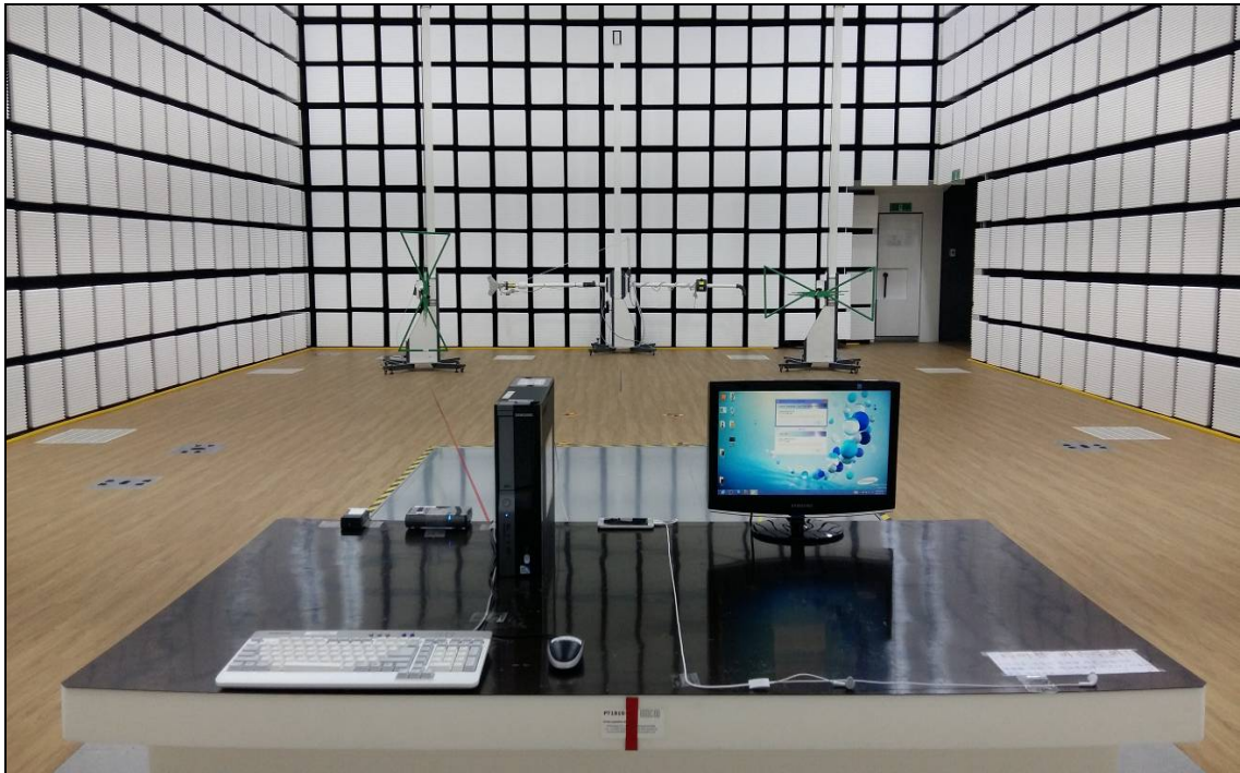
[ Radiated Disturbance for Below 1 GHz – Front ]