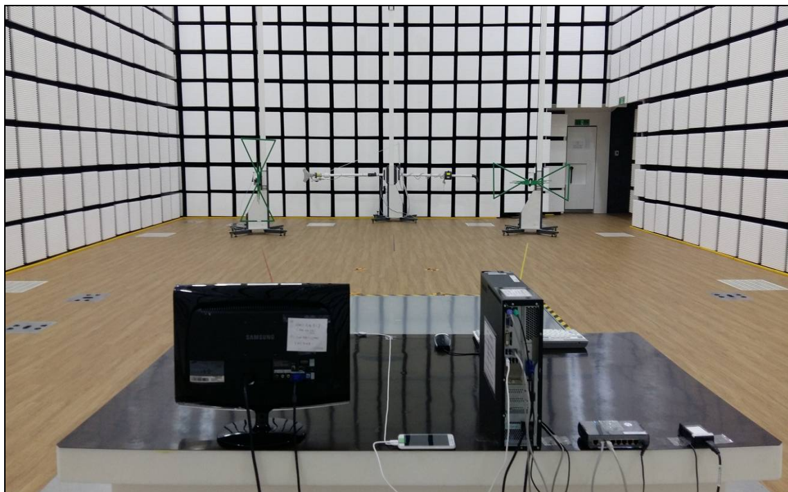
[ Radiated Disturbance for Below 1 GHz – Rear ]