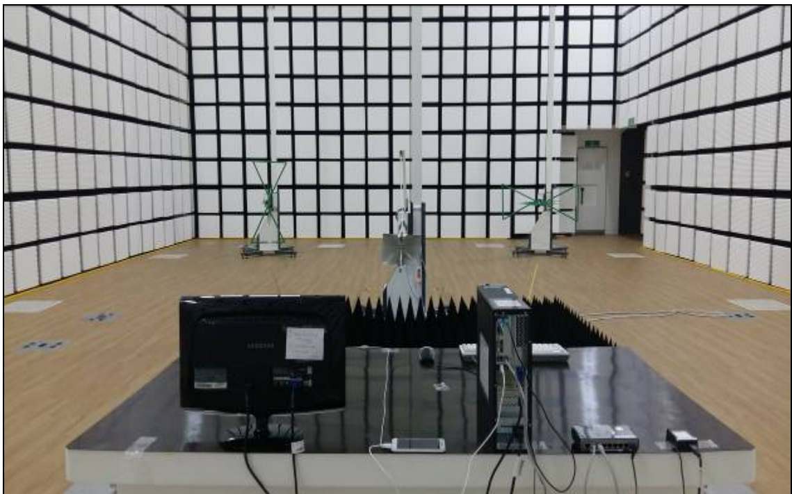
[ Radiated Disturbance for Above 1 GHz – Rear ]