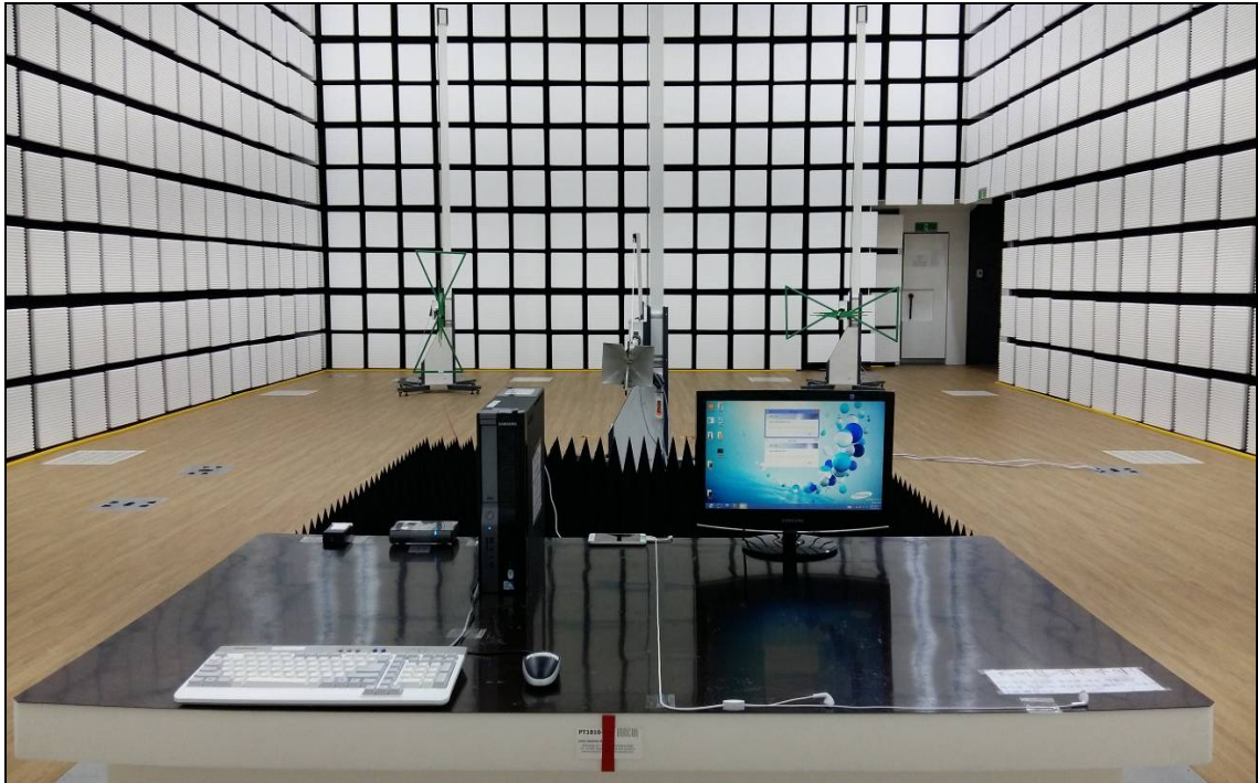
[ Radiated Disturbance for Above 1 GHz – Front ]