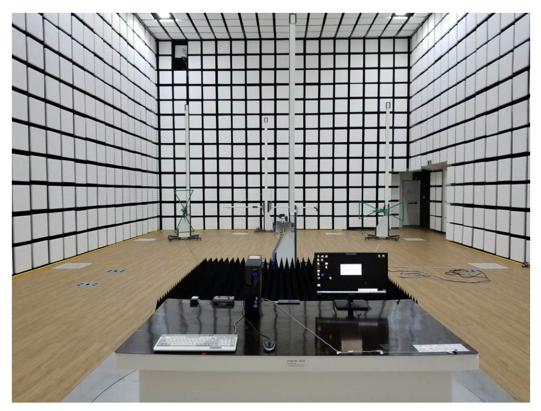
[ Radiated Disturbance for Above 1 GHz – Front ]