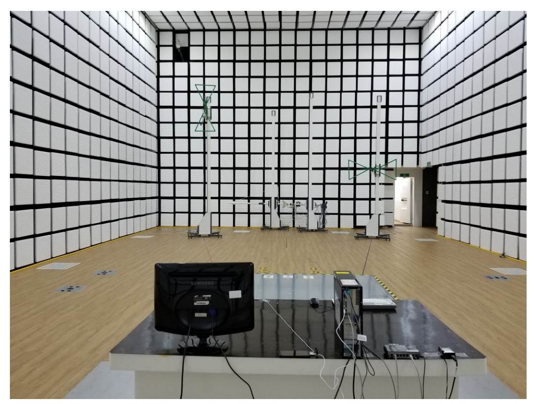
[ Radiated Disturbance for Below 1 GHz - Rear ]