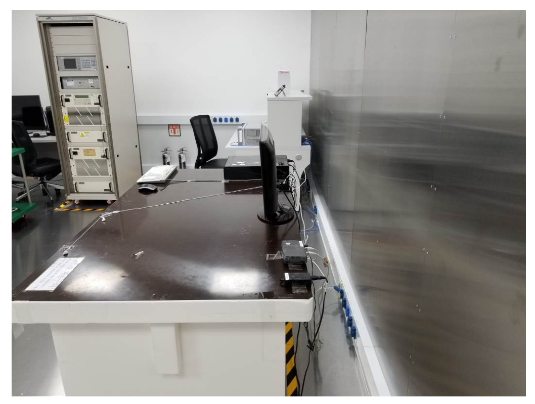
[ Conducted Disturbance – Rear ]