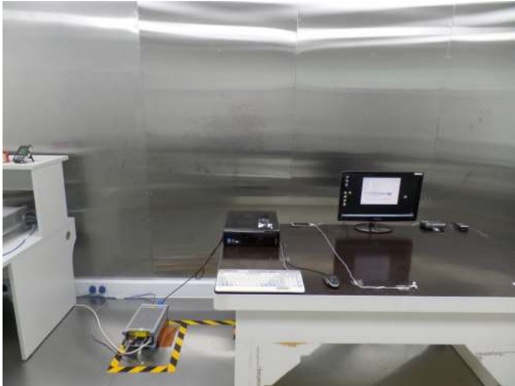
[ Conducted Disturbance – Front ]