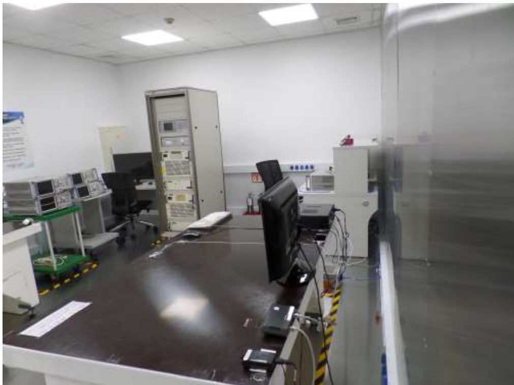
[ Conducted Disturbance – Rear ]