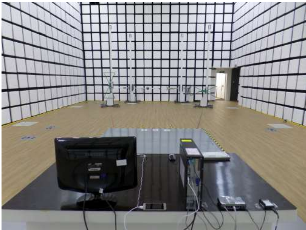
[ Radiated Disturbance for Below 1 GHz – Rear ]