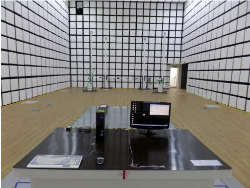
[ Radiated Disturbance for Below 1 GHz – Front ]