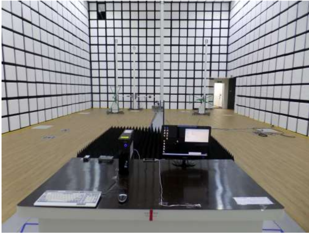
[ Radiated Disturbance for Above 1 GHz – Front ]