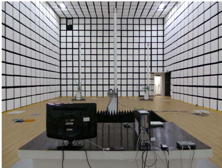
[ Radiated Disturbance for Above 1 GHz – Rear ]