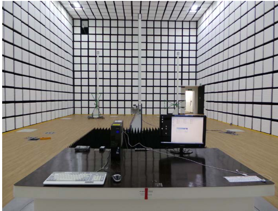
[ Radiated Disturbance for Above 1 GHz – Front ]