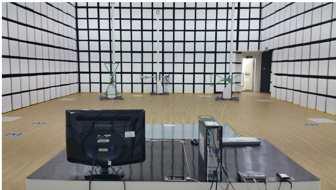
[ Radiated Disturbance for Below 1 GHz – Rear ]