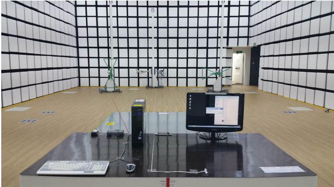
[ Radiated Disturbance for Below 1 GHz – Front ]