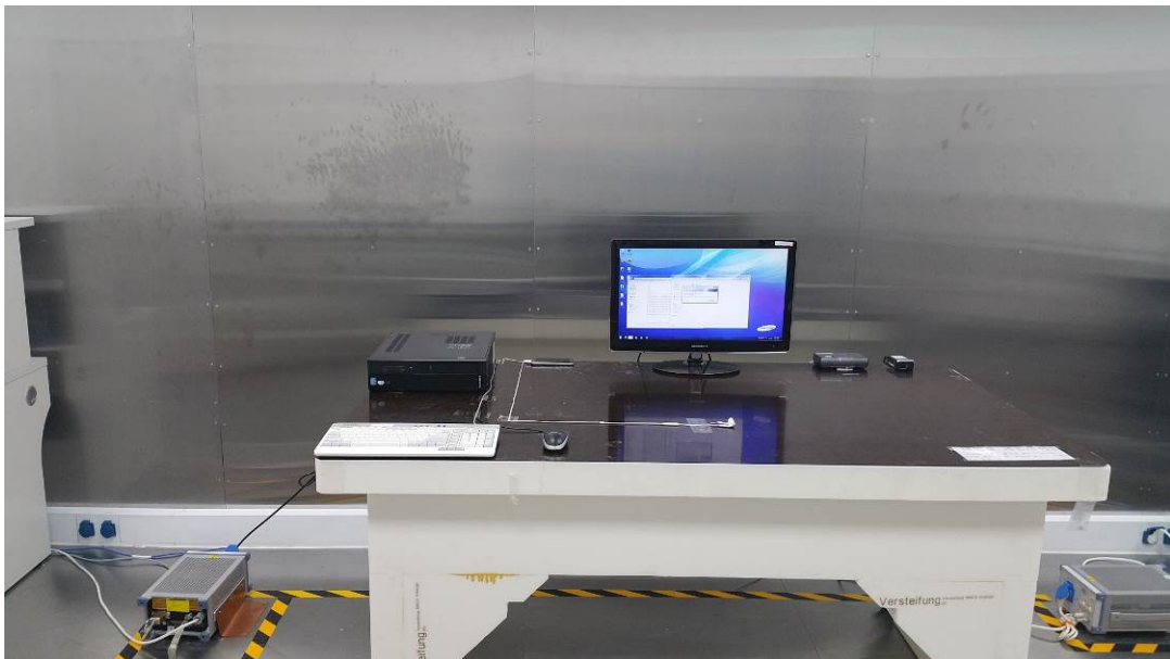
[ Conducted Disturbance – Front ]