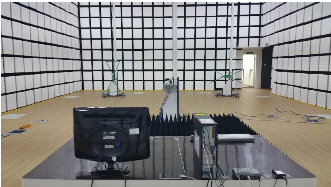
[ Radiated Disturbance for Above 1 GHz – Rear ]