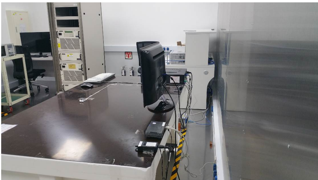
[ Conducted Disturbance – Rear ]