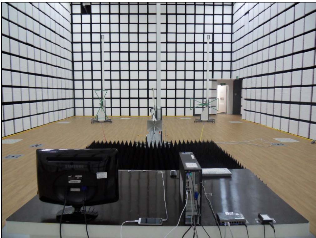
[ Radiated Disturbance for Above 1 GHz – Rear ]