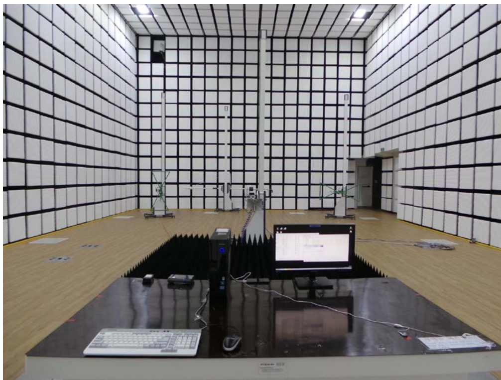
[ Radiated Disturbance for Above 1 GHz – Front ]