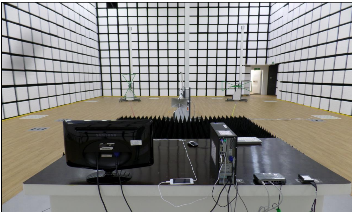
[ Radiated Disturbance for Above 1 GHz – Rear ]