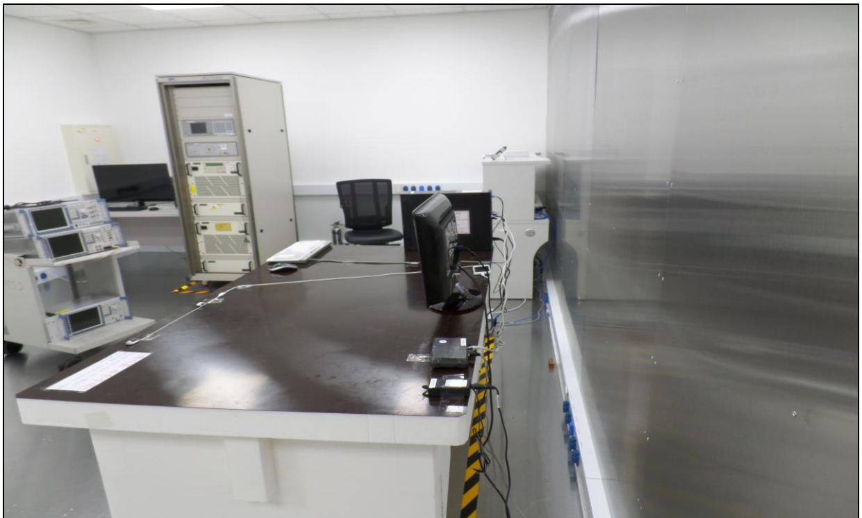
[ Conducted Disturbance – Rear ]