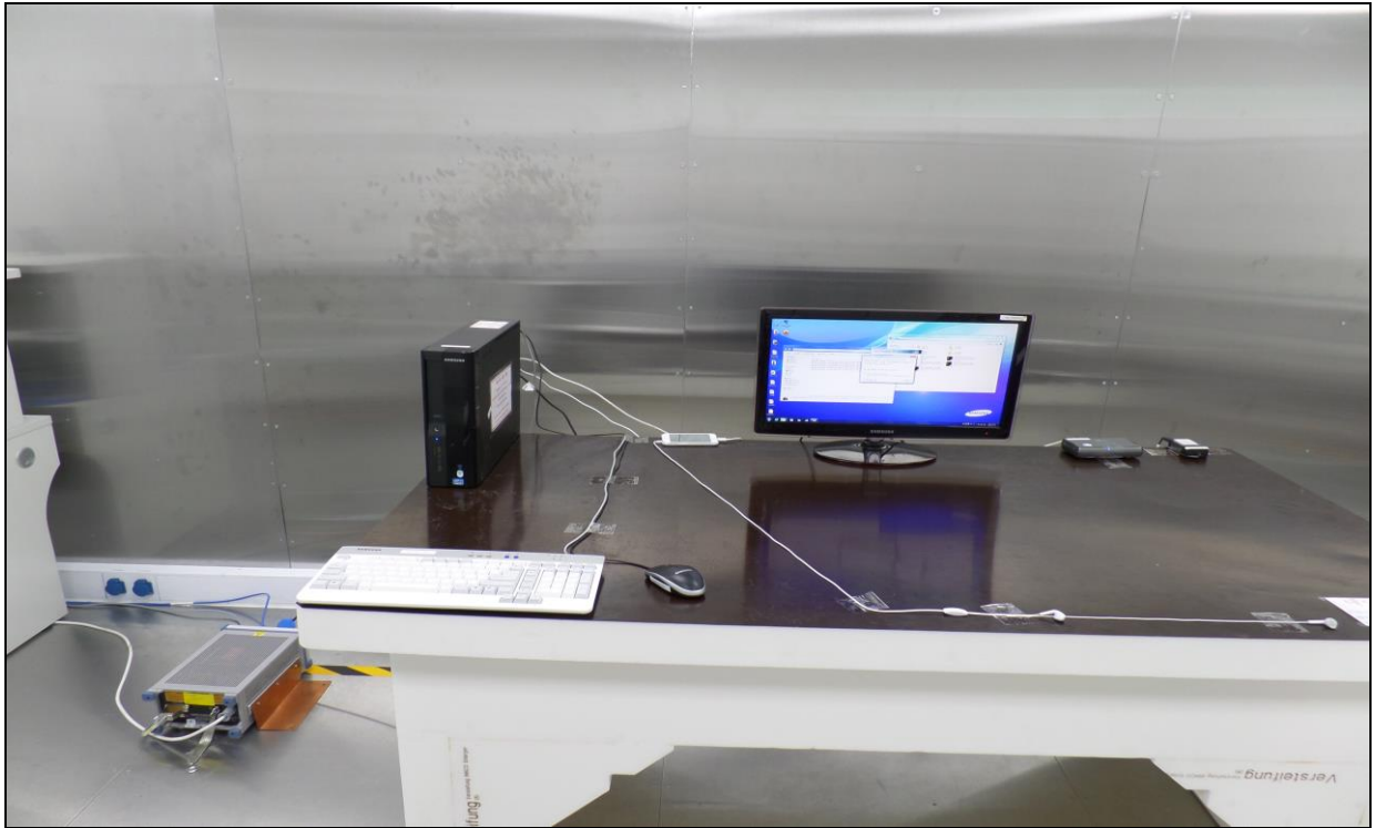
[ Conducted Disturbance – Front ]