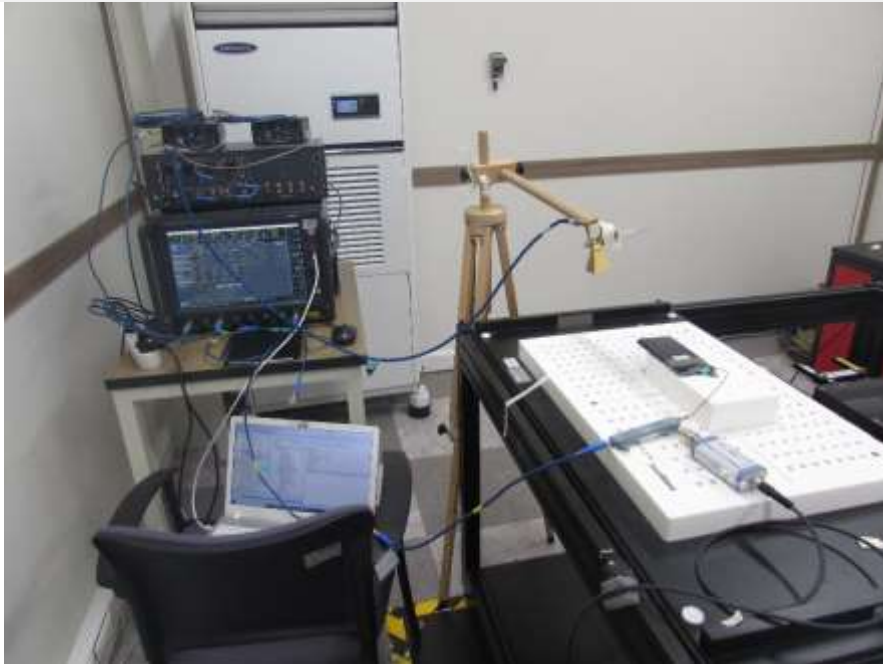
Test setup photo- (9-3 mmW NR radiated power density measurement)