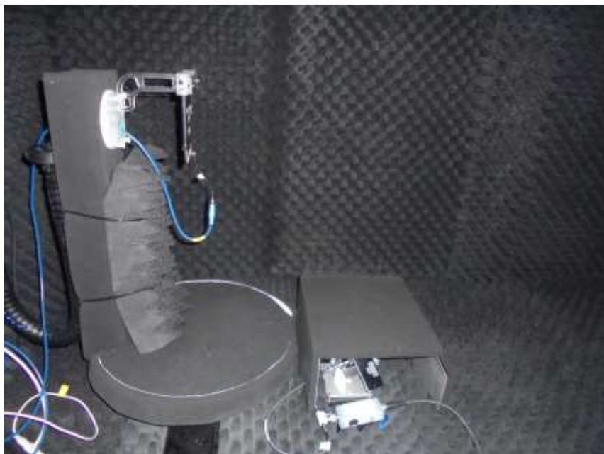
Test setup photo- (9-2 mmW NR radiated power measurement)