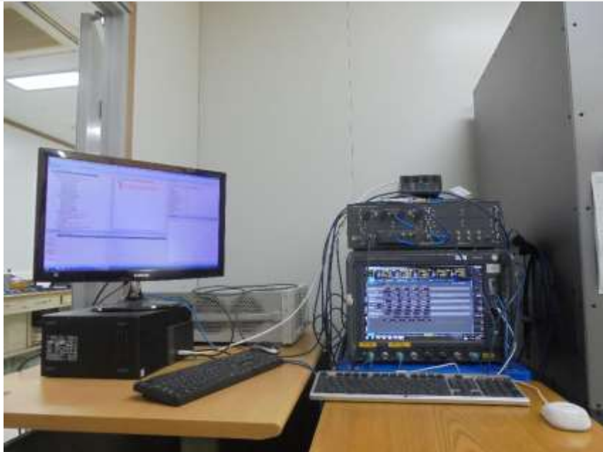
Test setup photo- (9-1 mmW NR radiated power measurement)