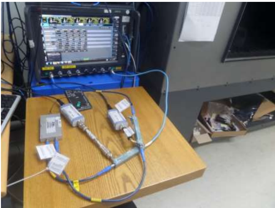
Test setup photo-4 (8-1(c) 5G Sub 6)