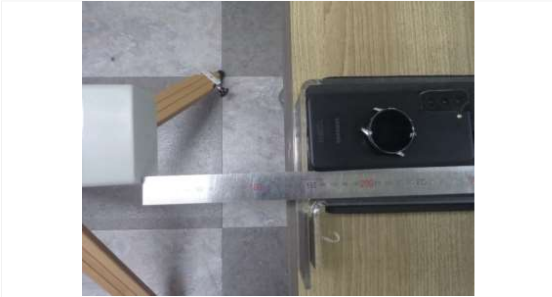
Edge 3 : 15 cm