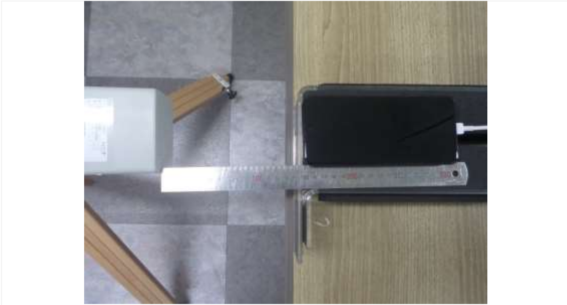
Edge 1+ TA