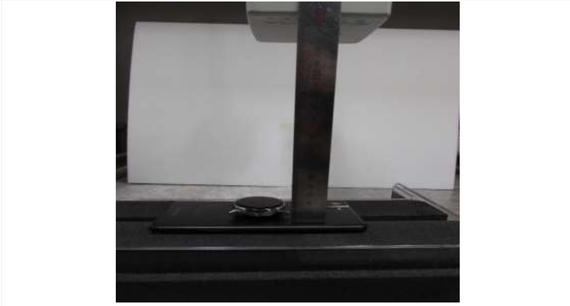
Top :20 cm