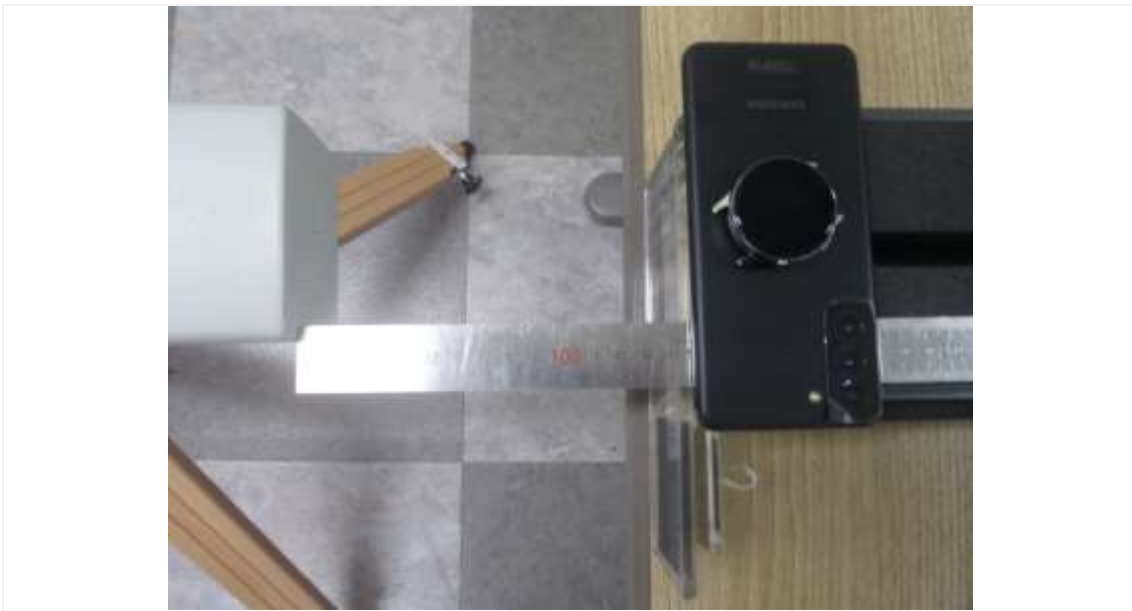
Edge 2: 15 cm