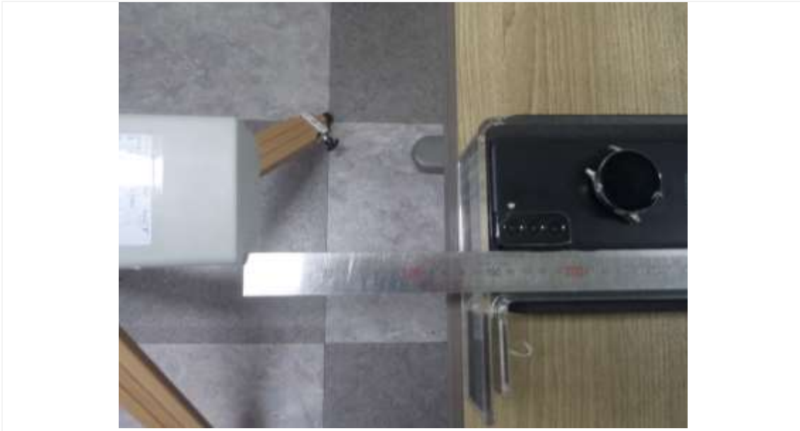
Edge 1 : 15 cm