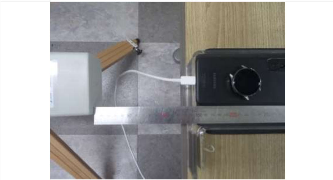
Edge 3+TA : 15 cm