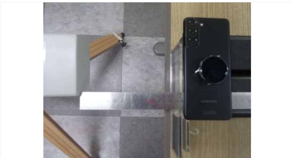
Edge 4: 15 cm