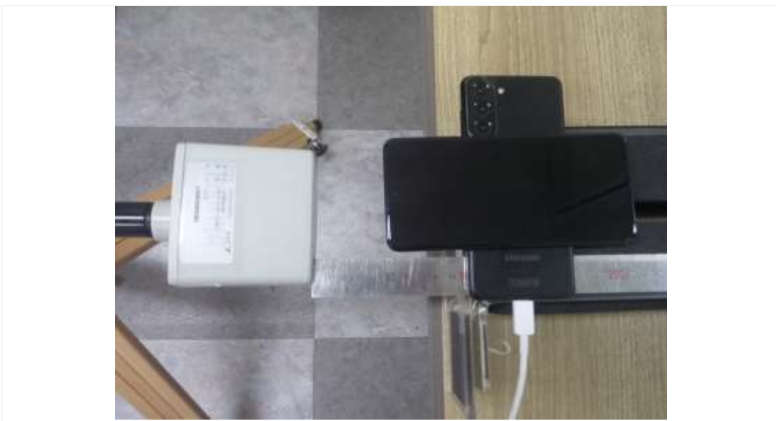
Edge 2+ TA