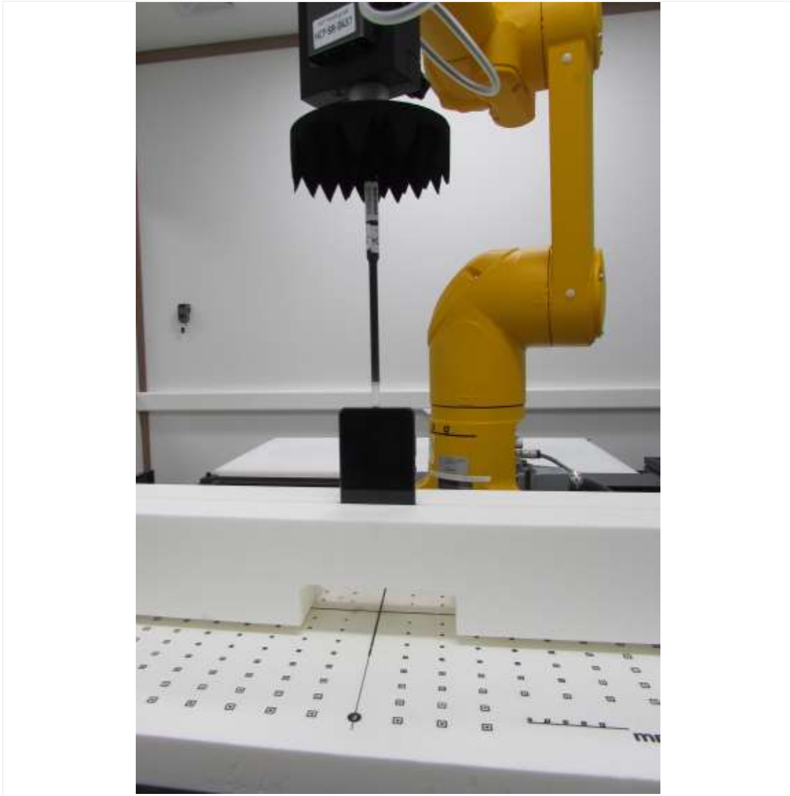
Distance of 2 mm from the EUT