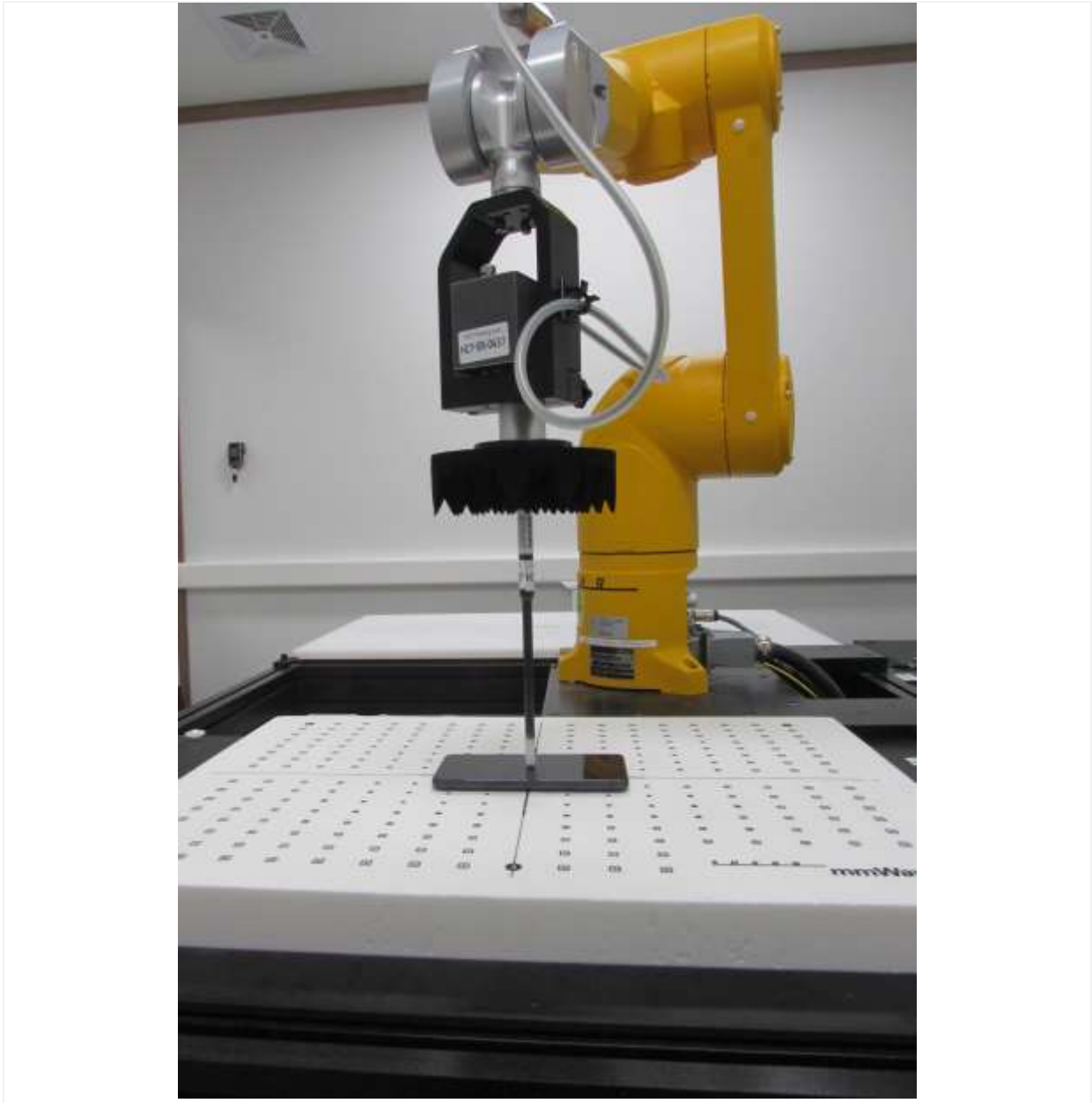
Distance of 2 mm from the EUT