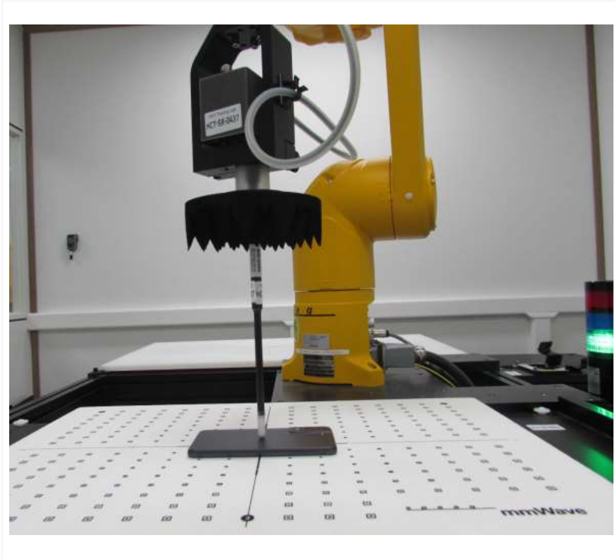
Distance of 2 mm from the EUT