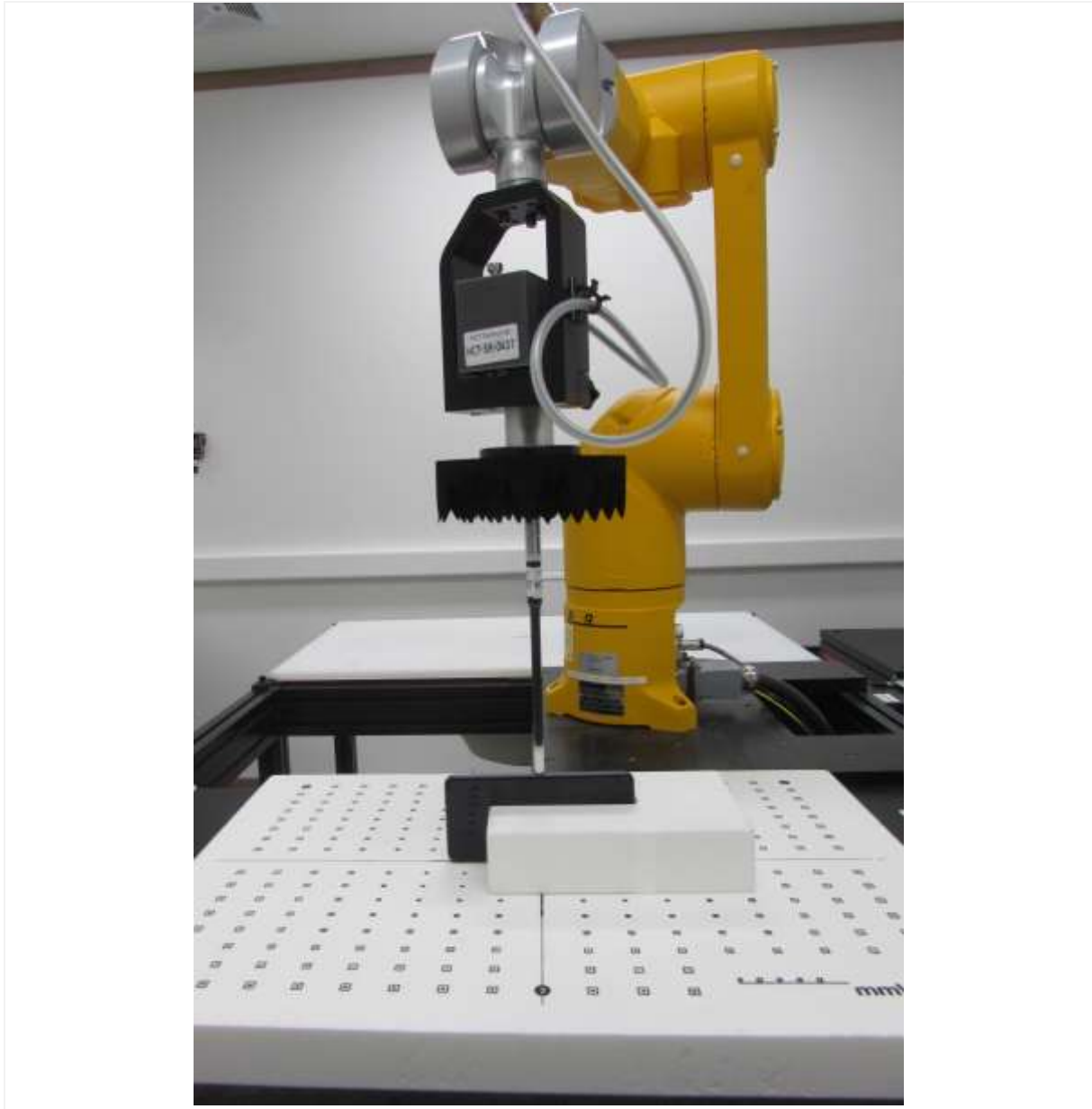
Distance of 2 mm from the EUT