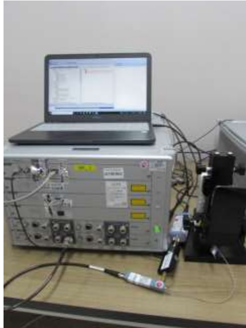
Test setup photo-3 (8-1(b) 5G Sub 6 setup)