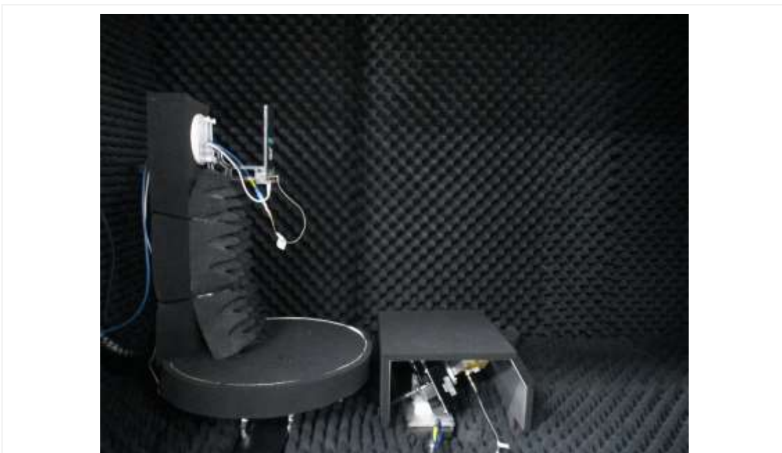
Test setup photo- (9-1 mmW NR radiated power measurement)