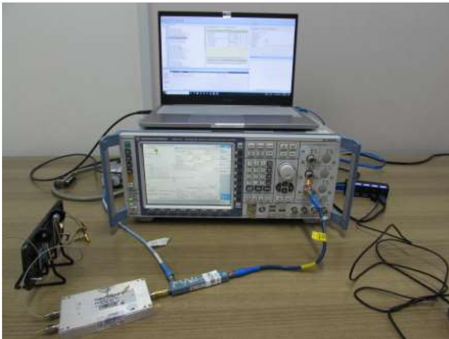
Test setup photo-2 (8-1(b) Legacy)