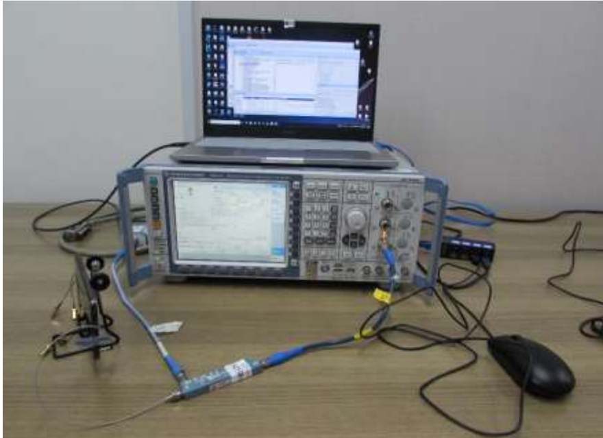
Test setup photo-1 (8-1(a) Legacy)