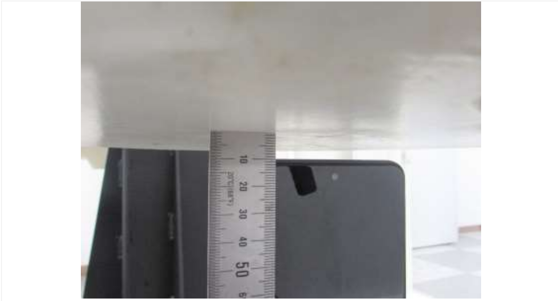
Distance of 10 mm from the EUT