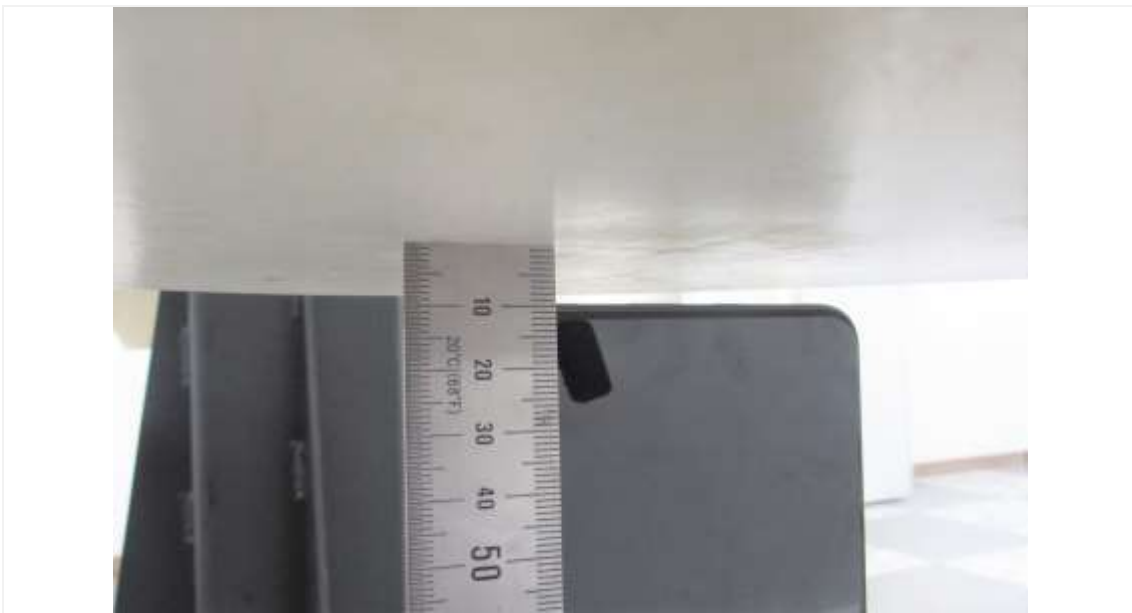
Distance of 10 mm from the EUT