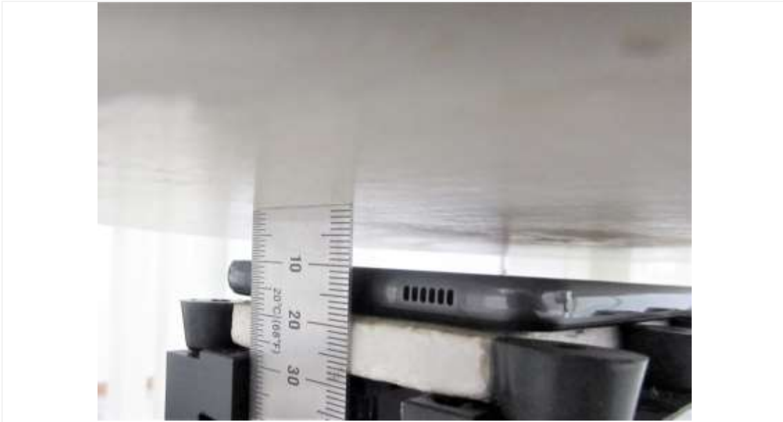
Distance of 10 mm from the EUT