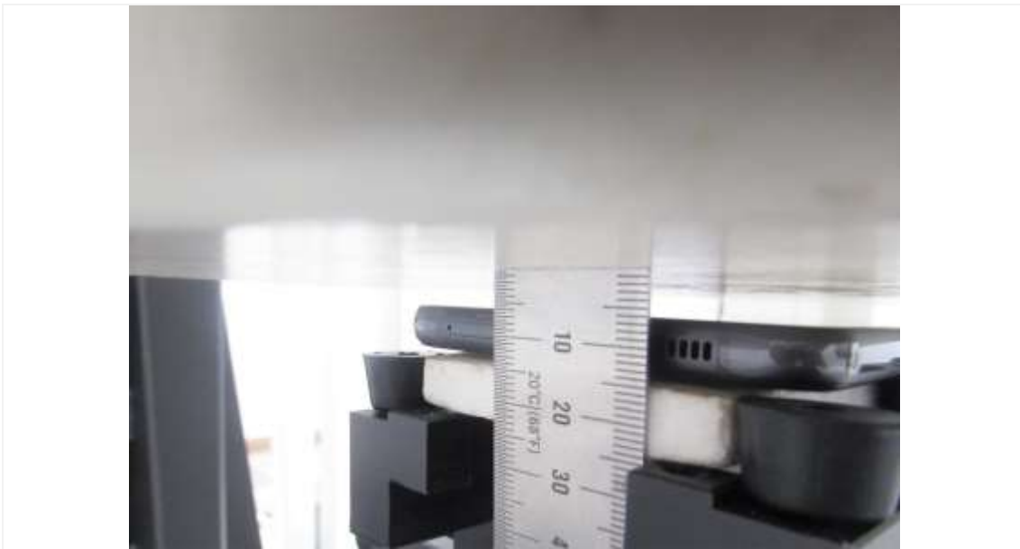
Distance of 6 mm from the EUT