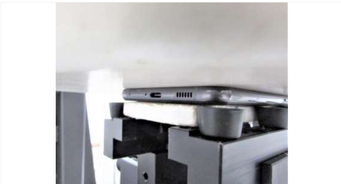
Distance of 0 mm from the EUT