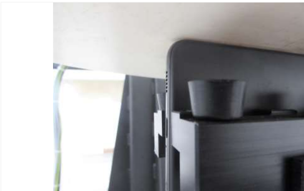
Distance of 0 mm from the EUT