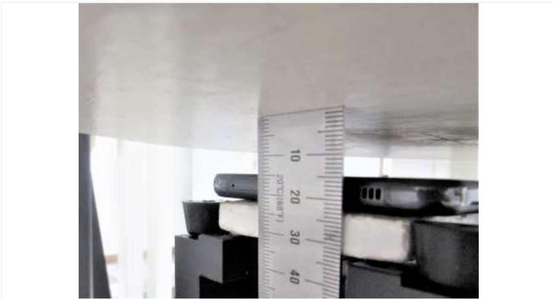
Distance of 15 mm from the EUT