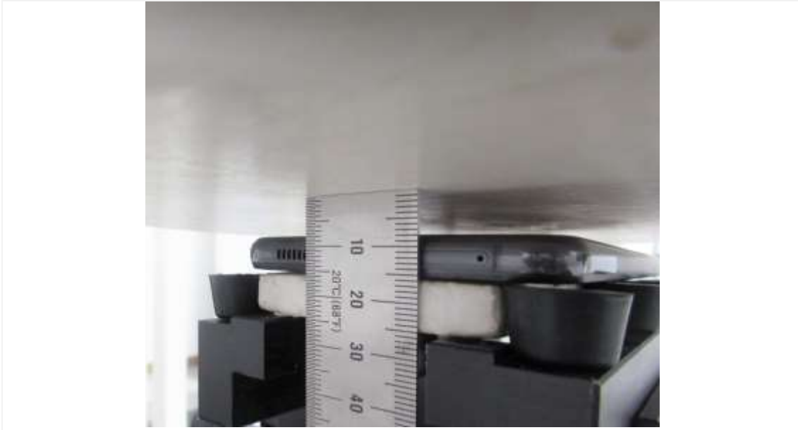
Distance of 8 mm from the EUT