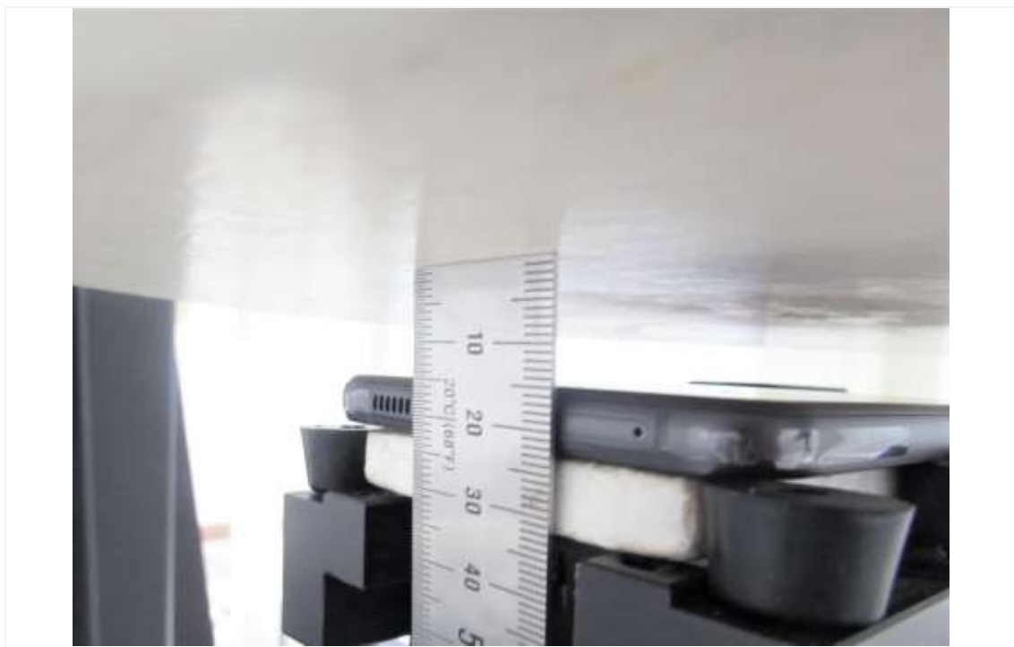
Distance of 15 mm from the EUT