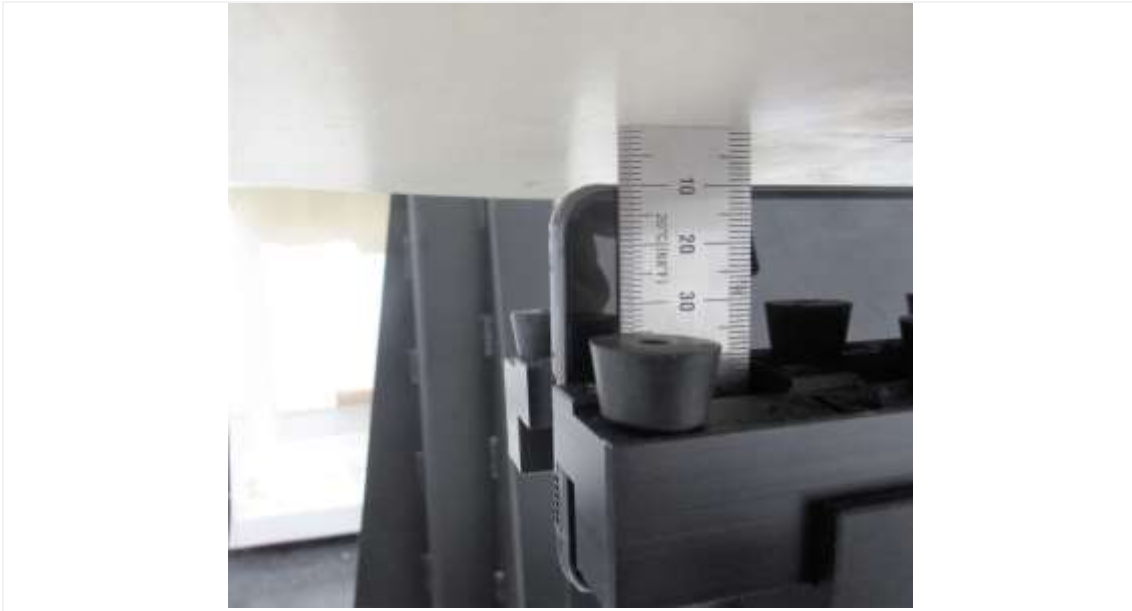
Distance of 10 mm from the EUT