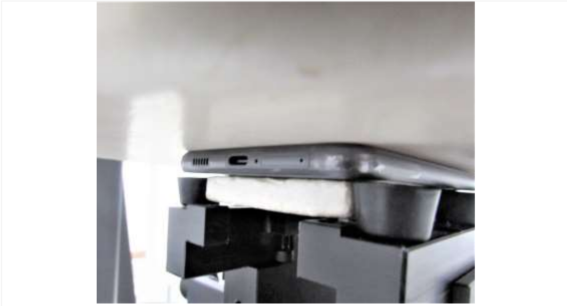
Distance of 0 mm from the EUT