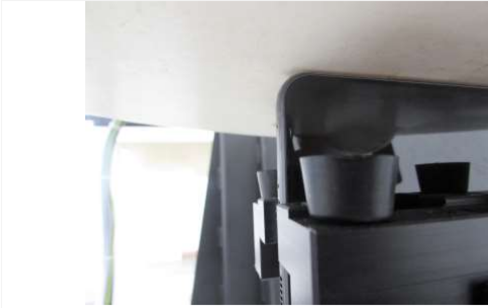
Distance of 0 mm from the EUT