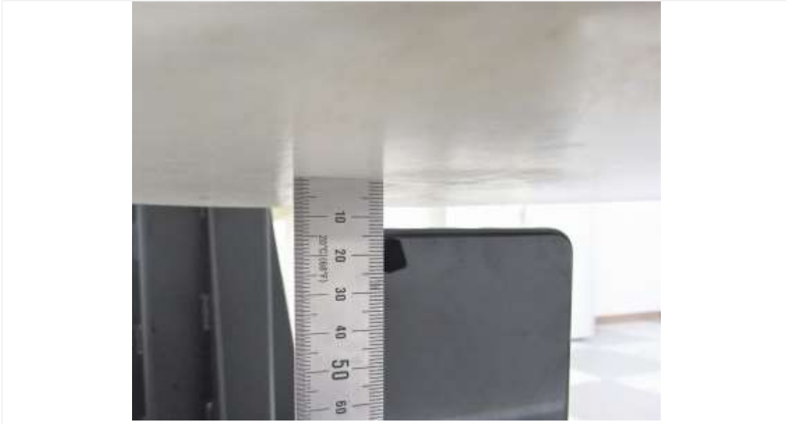
Distance of 13 mm from the EUT