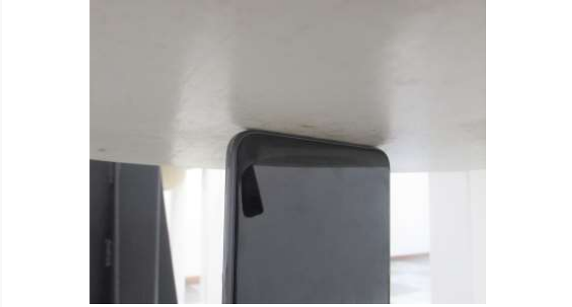
Distance of 0 mm from the EUT