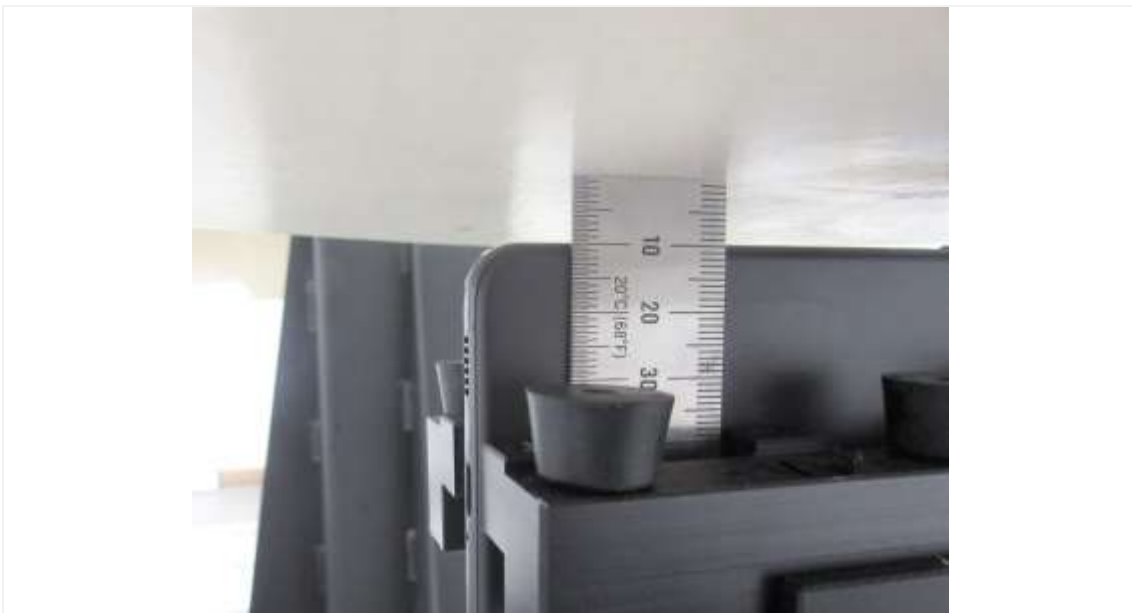
Distance of 10 mm from the EUT