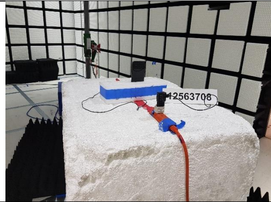
ABOVE 1GHz BACK PHOTO