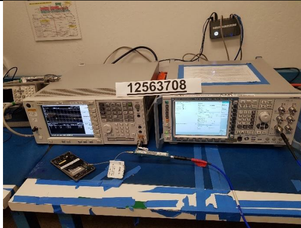
ANTENNA PORT CONDUCTED PHOTO