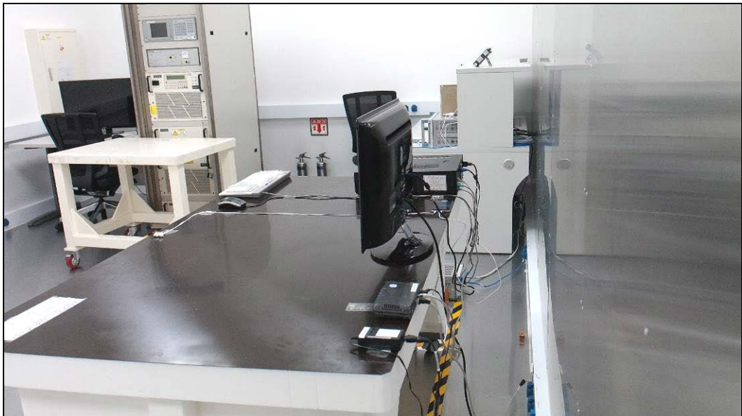
[ Conducted Disturbance – Rear ]