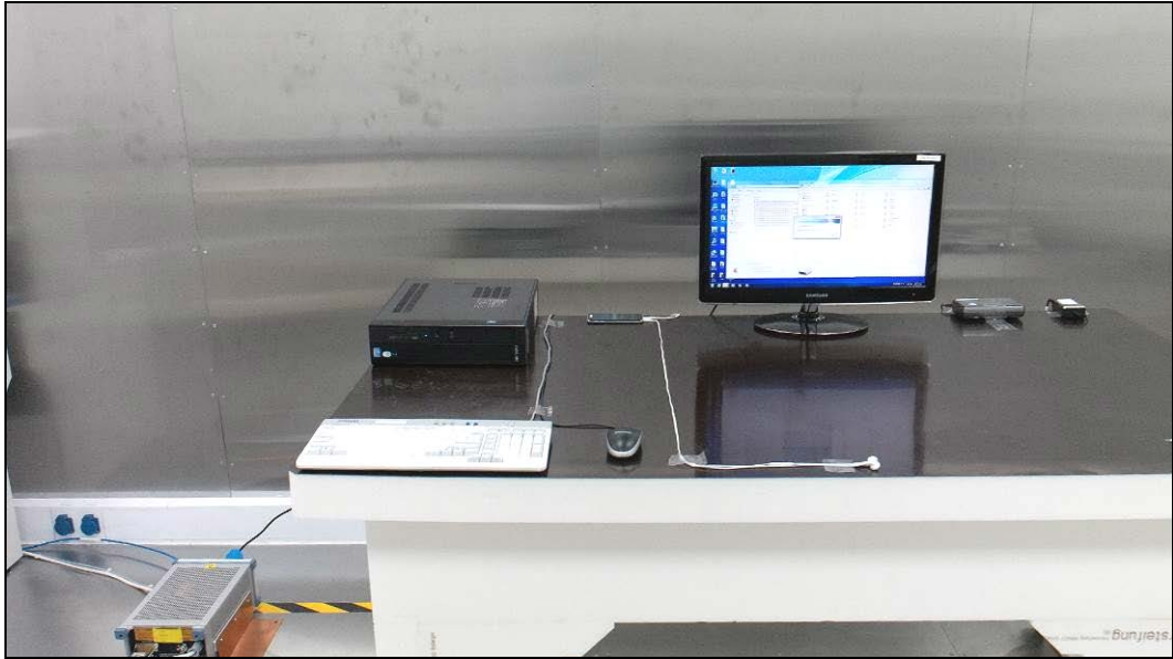
[ Conducted Disturbance – Front ]