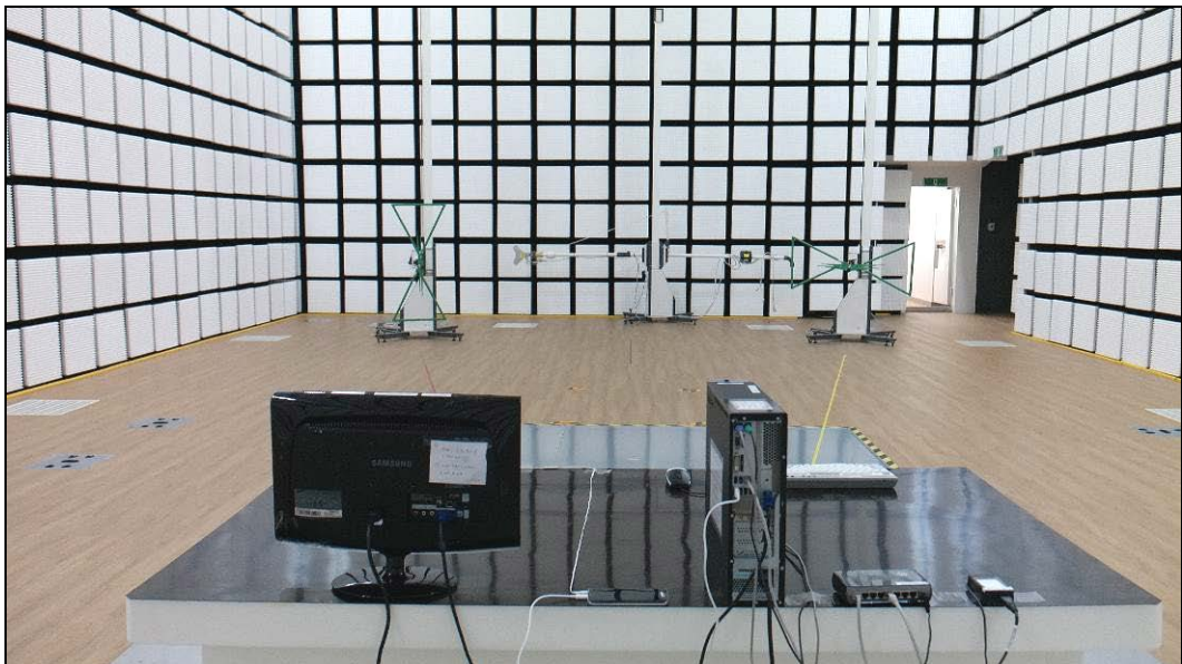
[ Radiated Disturbance for Below 1 GHz – Rear ]