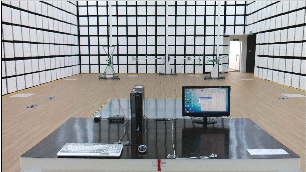
[ Radiated Disturbance for Below 1 GHz – Front ]