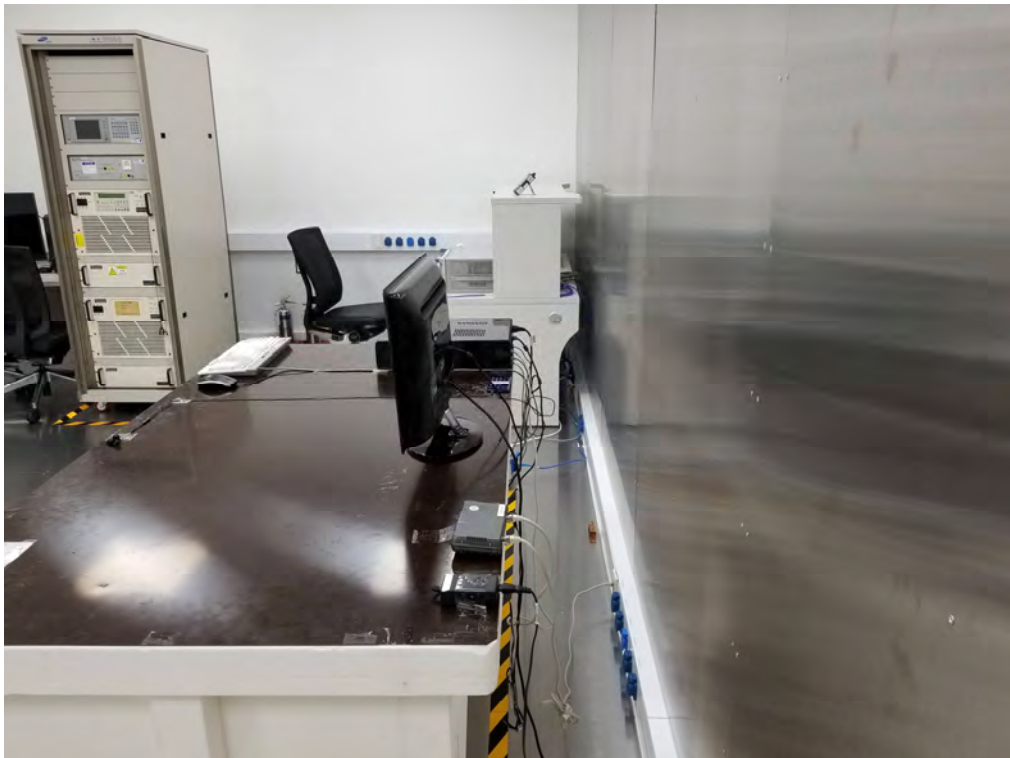
[ Conducted Disturbance – Rear ]