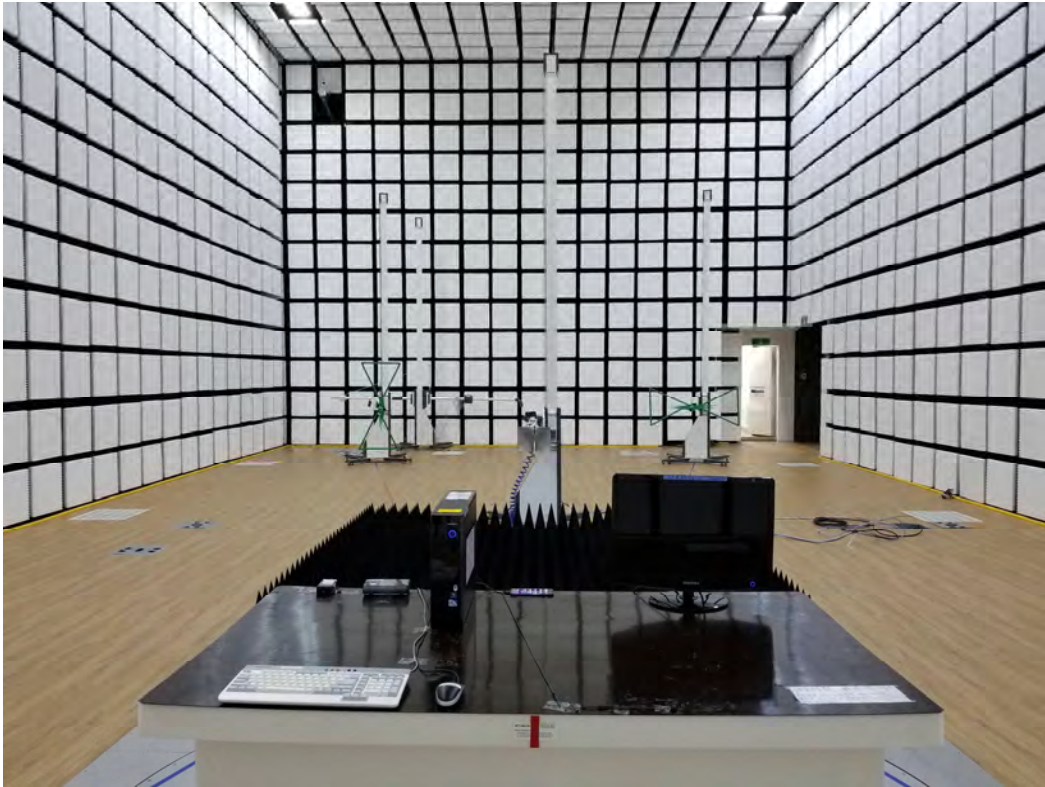
[ Radiated Disturbance for Above 1 GHz – Front ]