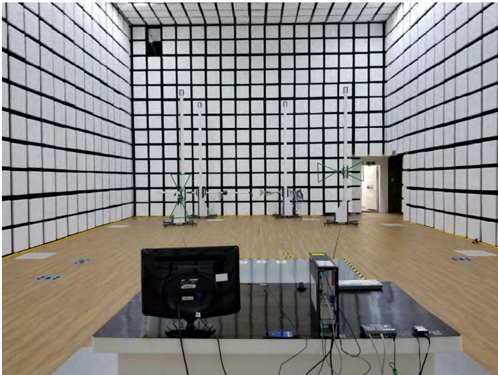
[ Radiated Disturbance for Below 1 GHz – Rear ]