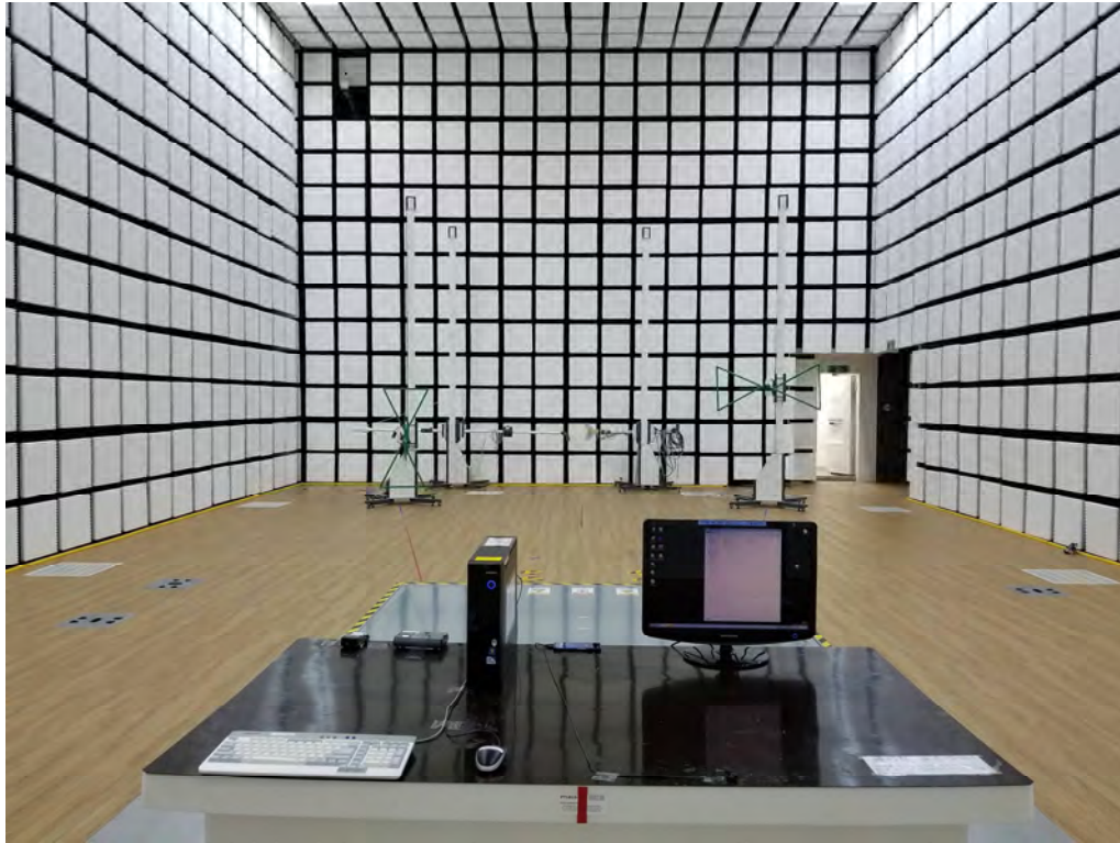
[ Radiated Disturbance for Below 1 GHz – Front ]