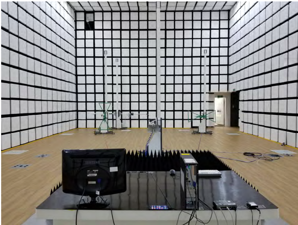
[ Radiated Disturbance for Above 1 GHz – Rear ]