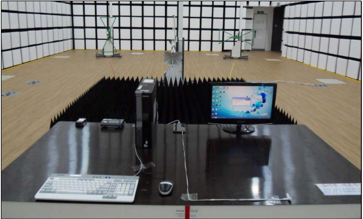
[ Radiated Disturbance for Above 1 GHz – Front ]