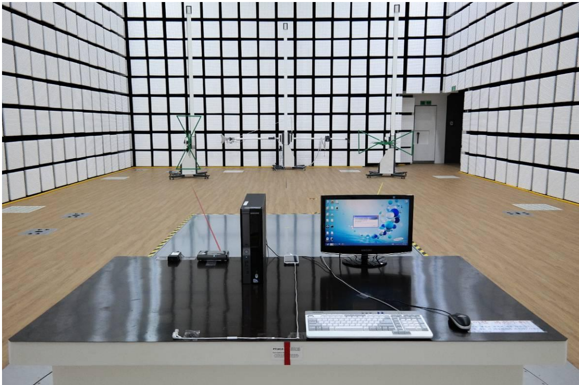
[ Radiated Disturbance for Below 1 GHz – Front ]