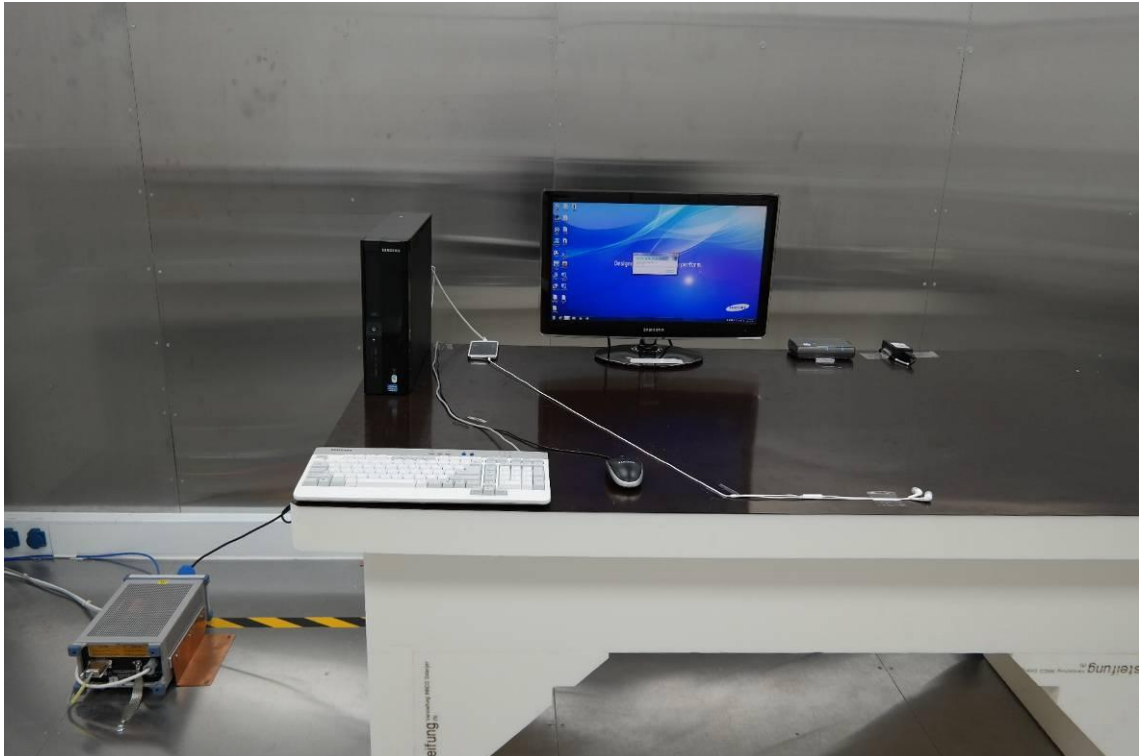
[ Conducted Disturbance – Front ]