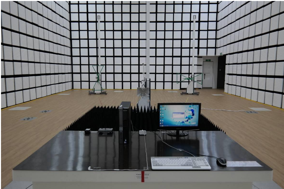
[ Radiated Disturbance for Above 1 GHz – Front ]