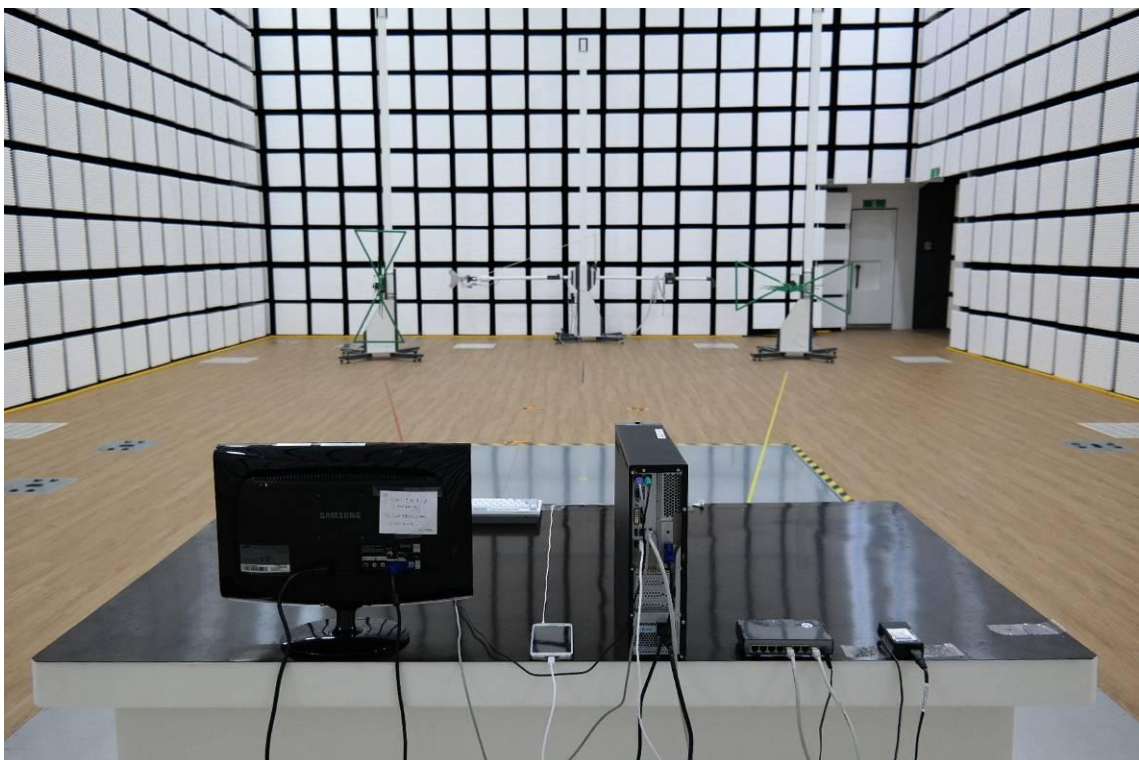
[ Radiated Disturbance for Below 1 GHz – Rear ]