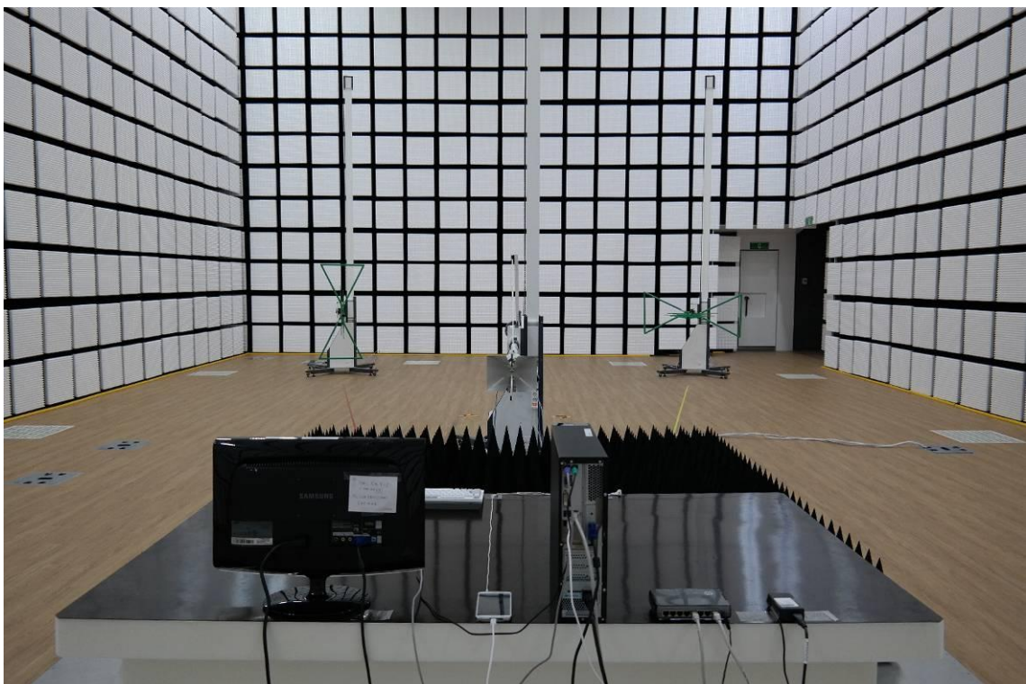
[ Radiated Disturbance for Above 1 GHz – Rear ]