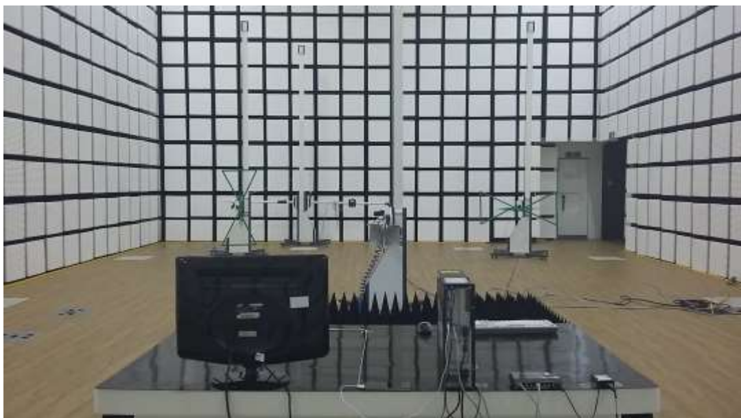
[ Radiated Disturbance for Above 1 GHz – Rear ]