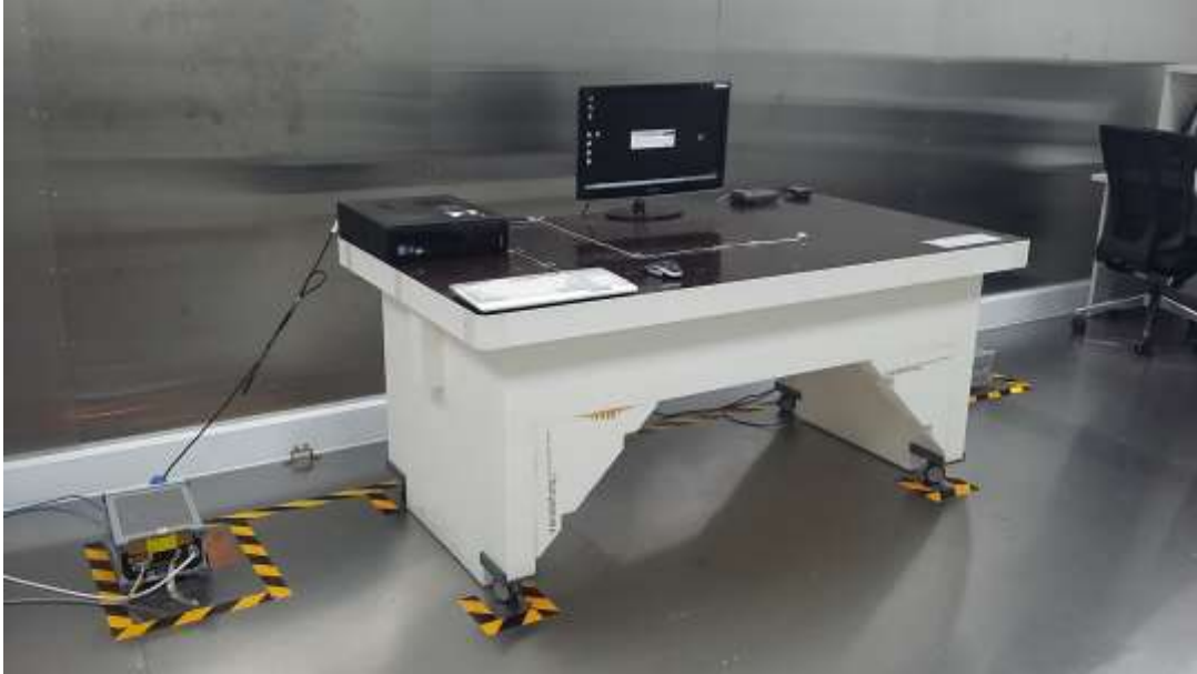
[ Conducted Disturbance – Front ]