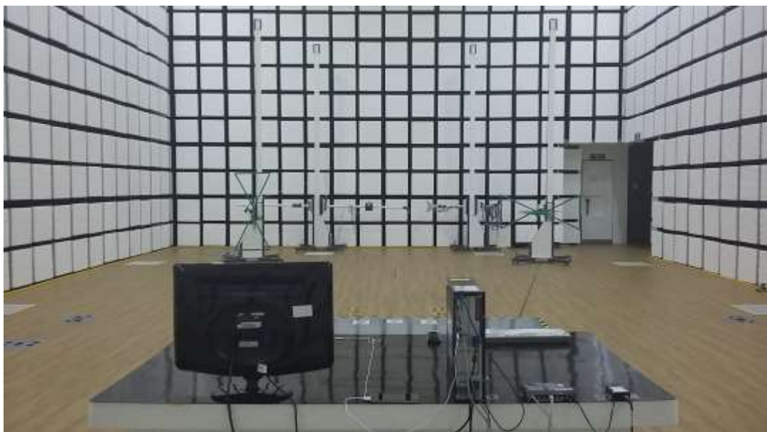
[ Radiated Disturbance for Below 1 GHz – Rear ]