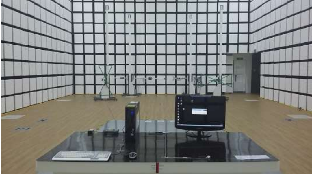
[ Radiated Disturbance for Below 1 GHz – Front ]