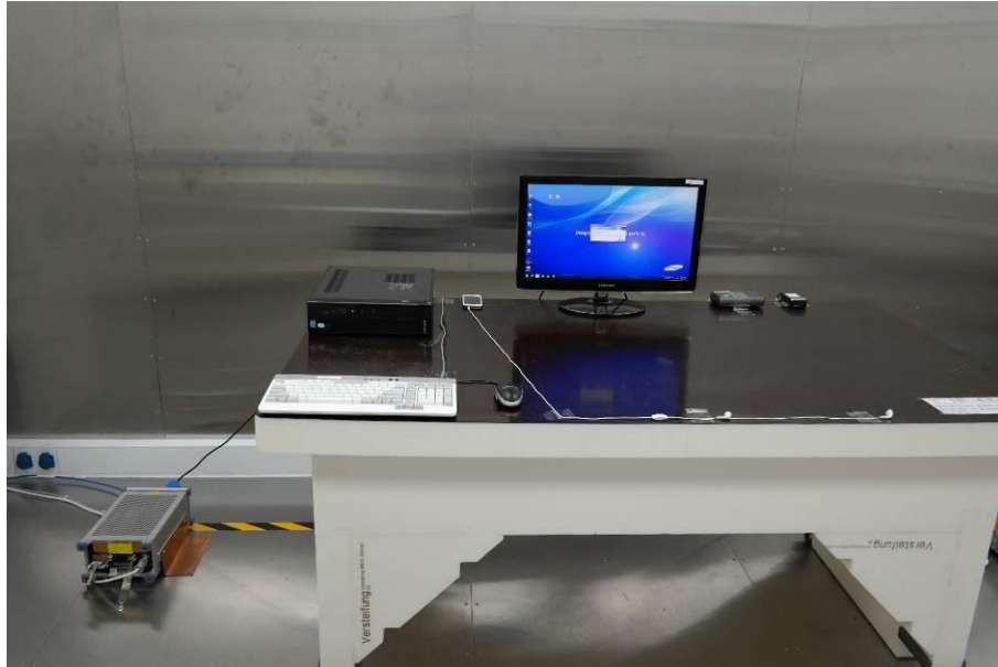
[ Conducted Disturbance – Front ]