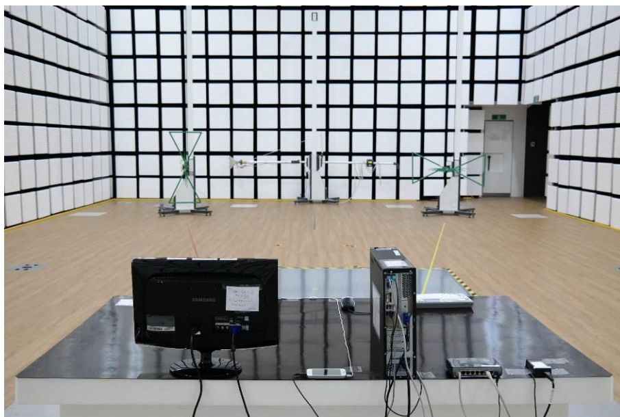
[ Radiated Disturbance for Below 1 GHz – Rear ]