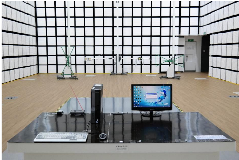
[ Radiated Disturbance for Below 1 GHz – Front ]