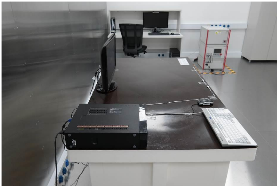
[ Conducted Disturbance – Rear ]