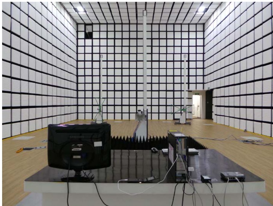
[ Radiated Disturbance for Above 1 GHz – Rear ]