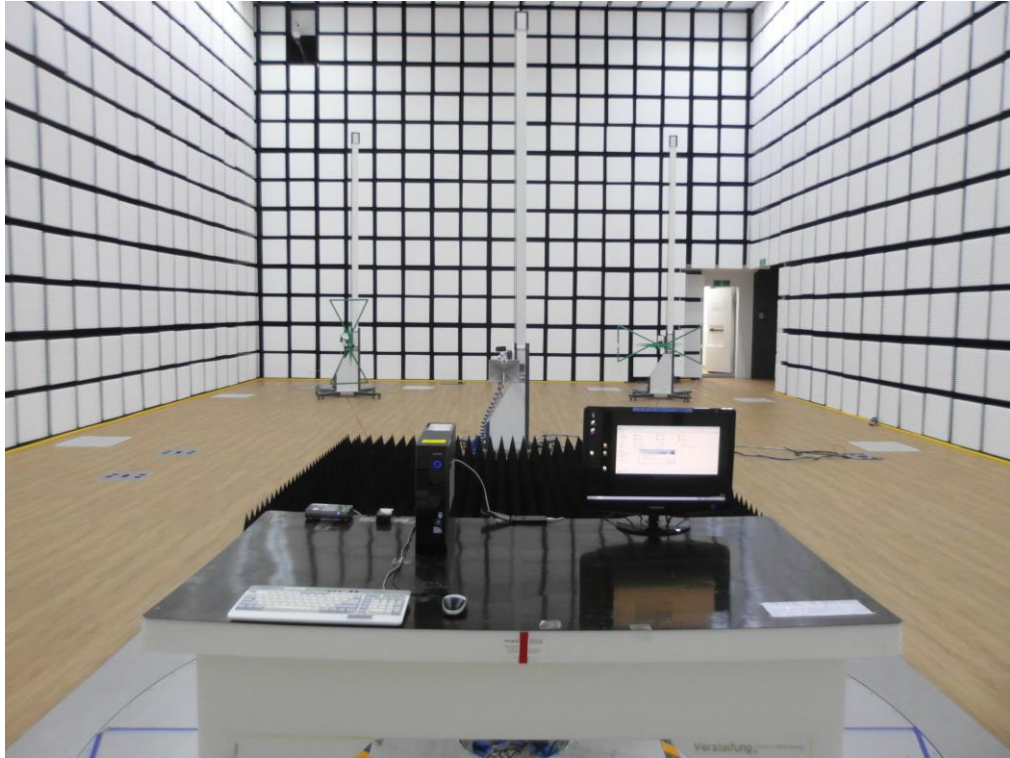
[ Radiated Disturbance for Above 1 GHz – Front ]