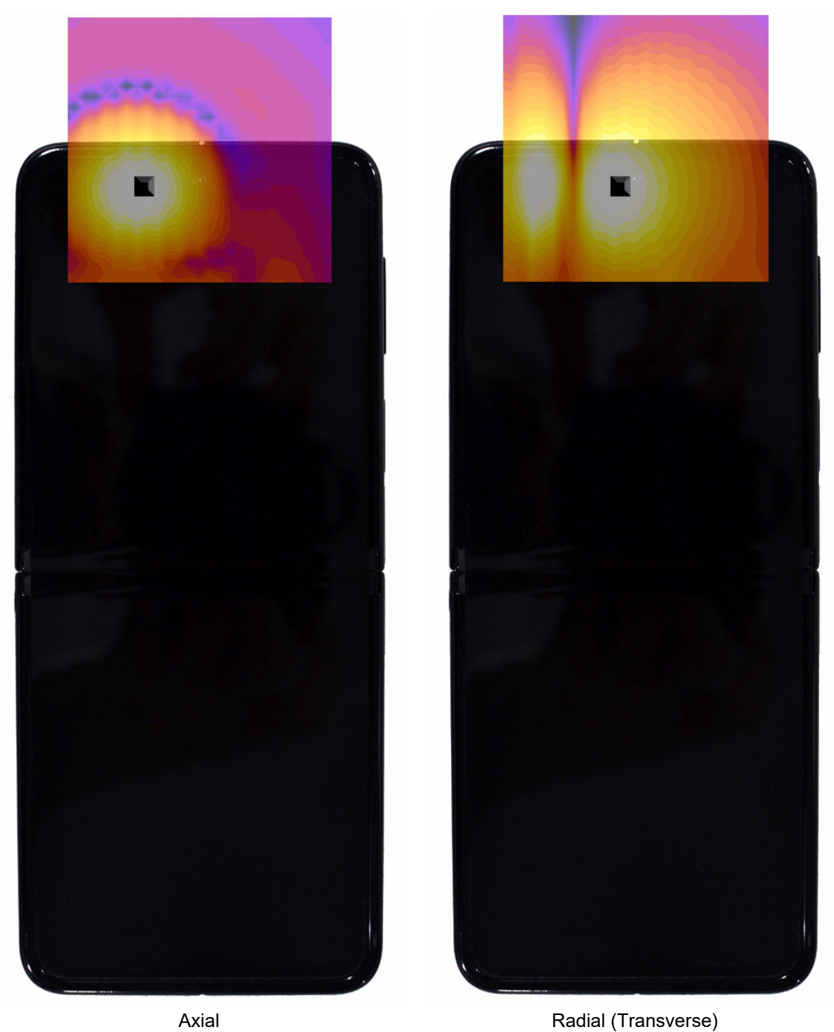
Figure 16-3 T-Coil Scan Overlay Magnetic Field Distributions

Note: Final measurement locations are indicated by a cursor on the contour plots.