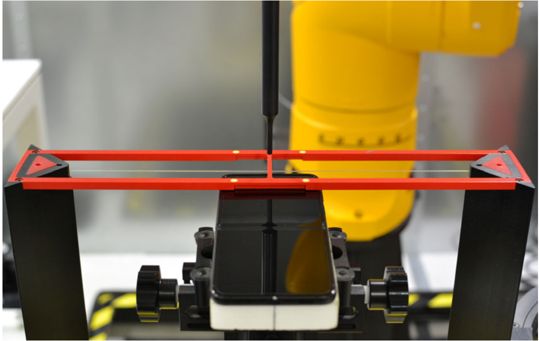
Figure 18-1 Ear Reference Point HAC Phantom Alignment