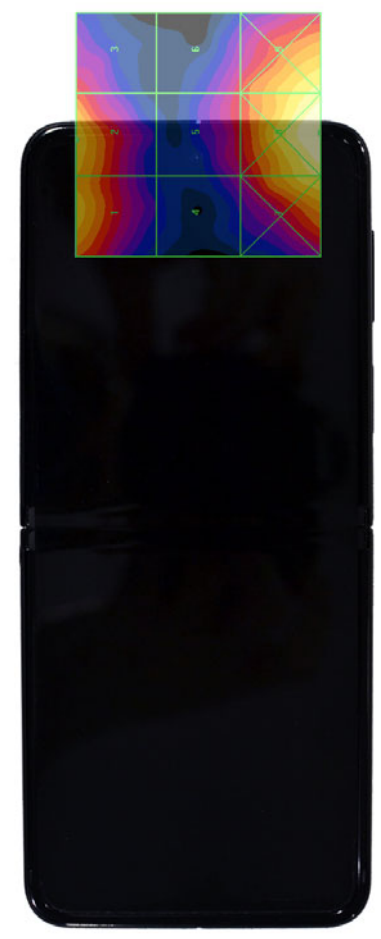
Figure 18-4 E-Field WD Scan overlay