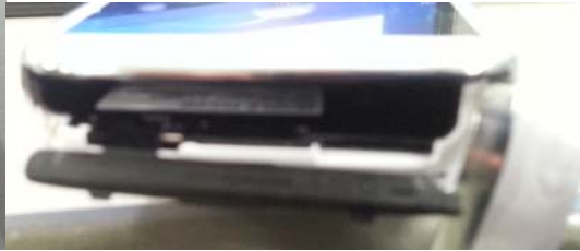
The FCC ID label is located in the battery compartment.