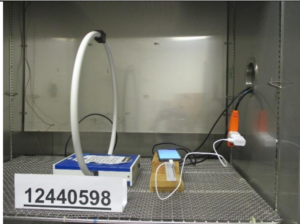
FREQUENCY TOLERANCE OVER EXTREME CONDITIONS