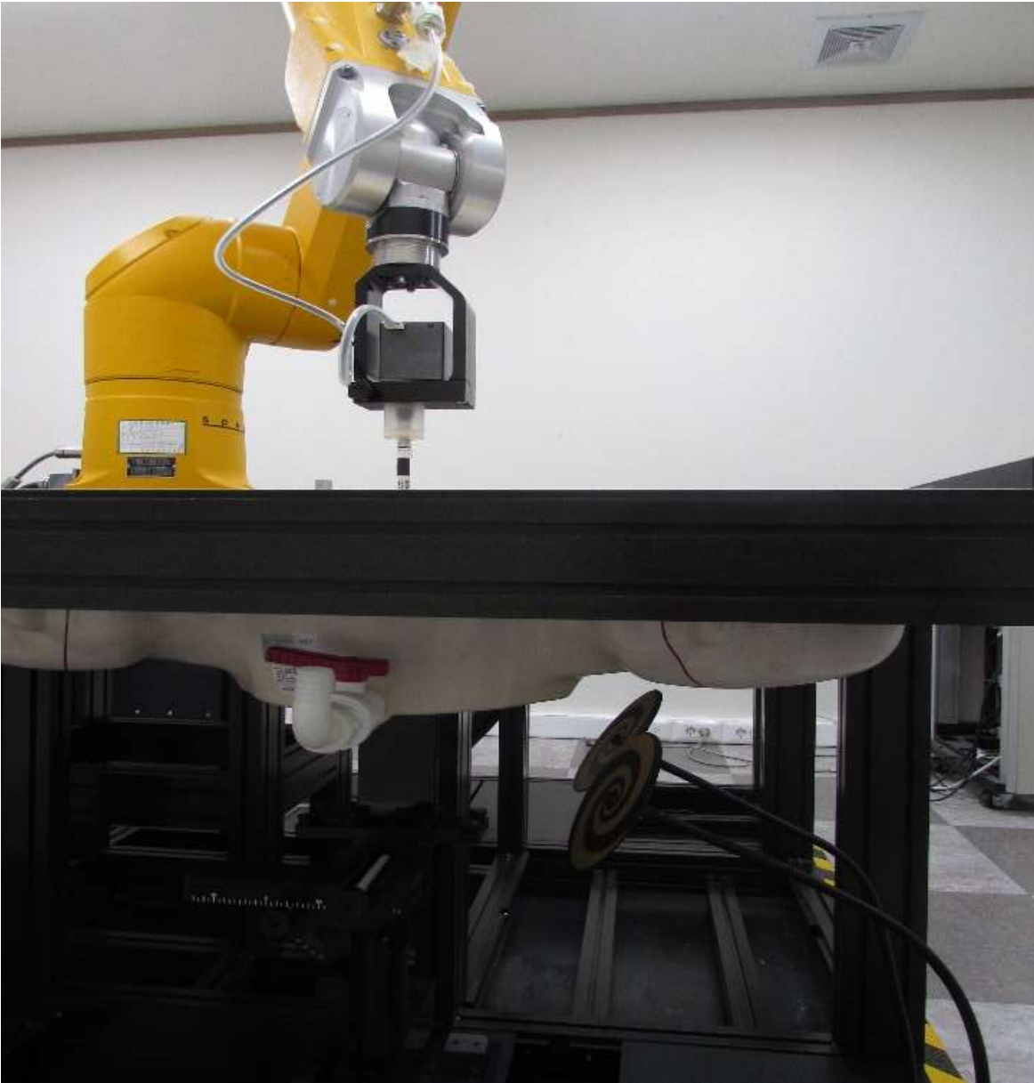
Test setup photo-5 (5G Sub6 TAS SAR)