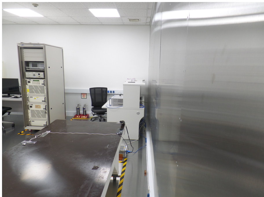
[ Mode 1 – 3 : Rear ]