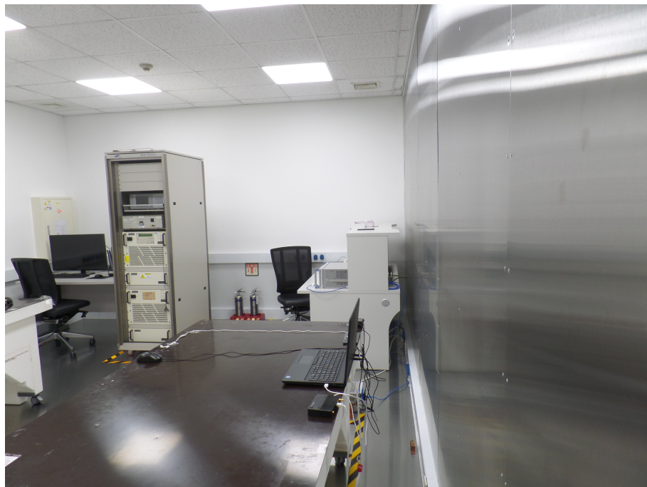
[ Mode 4 : Rear ]