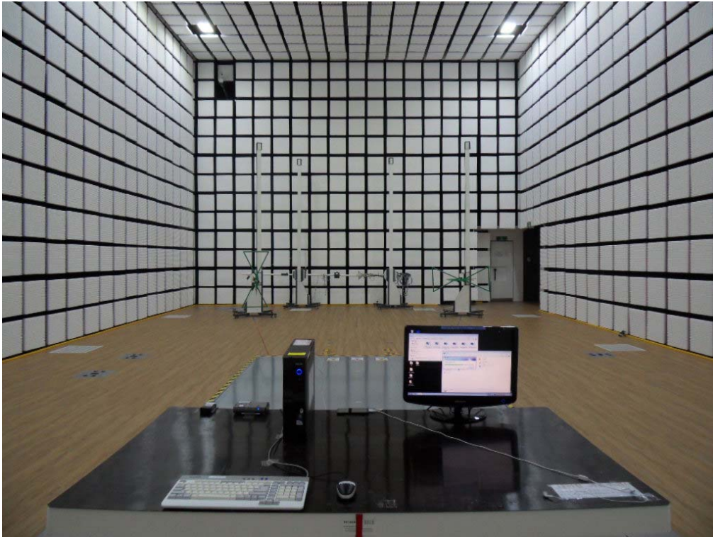
[ Radiated Disturbance for Below 1 GHz – Front ]