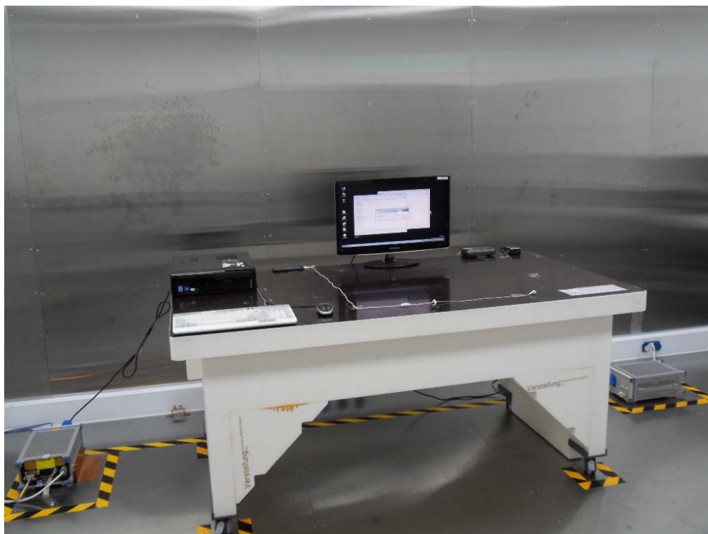
[ Conducted Disturbance – Front ]