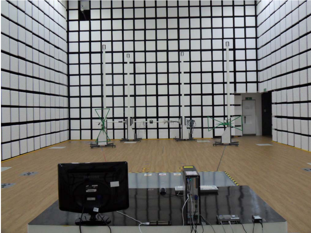
[ Radiated Disturbance for Below 1 GHz – Rear ]