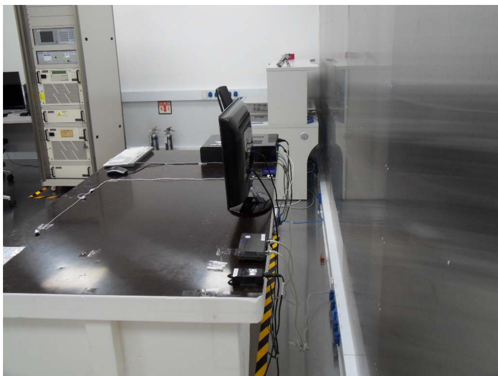
[ Conducted Disturbance – Rear ]