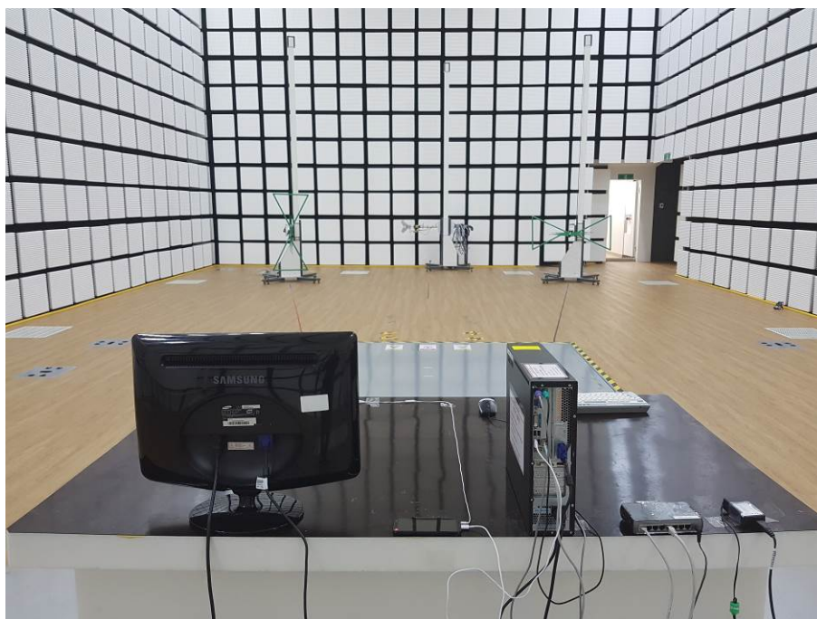
[ Radiated Disturbance for Below 1 GHz – Rear ]