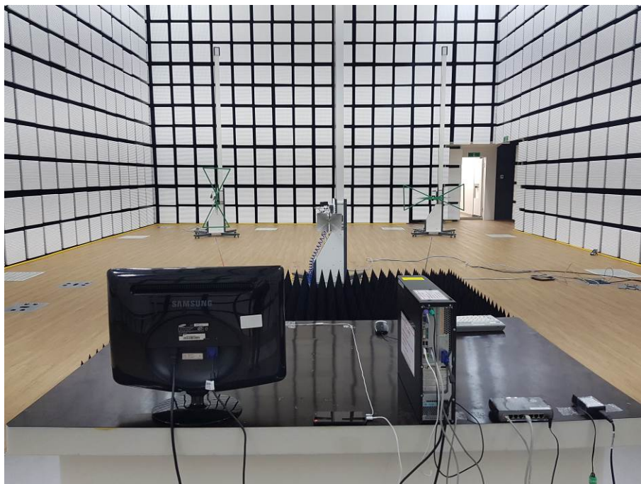
[ Radiated Disturbance for Above 1 GHz – Rear ]