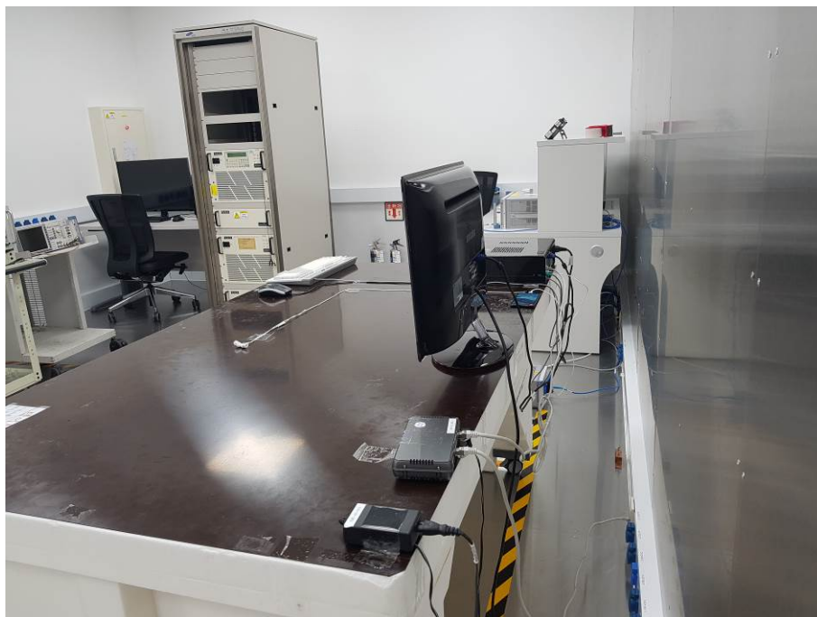
[ Conducted Disturbance – Rear ]