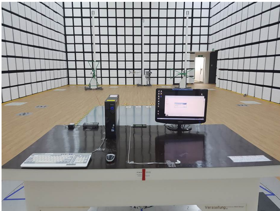
[ Radiated Disturbance for Below 1 GHz – Front ]