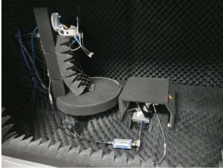
Test setup photo-6 (5G mmWave Radiation)