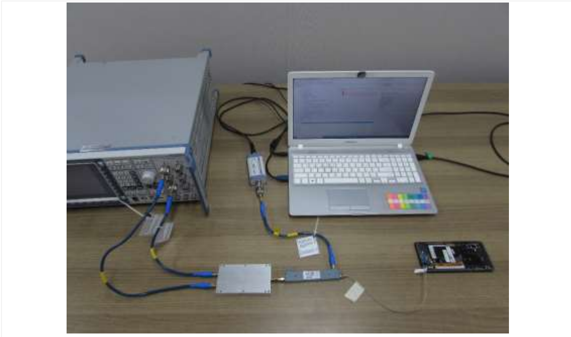
Test setup photo-2 (8-1(b) Tech Hand-over)