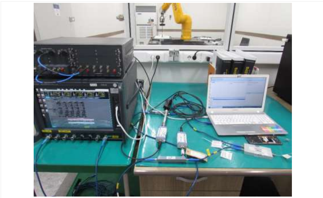
Test setup photo-3 (8-1(c) 5G Sub6 NR)