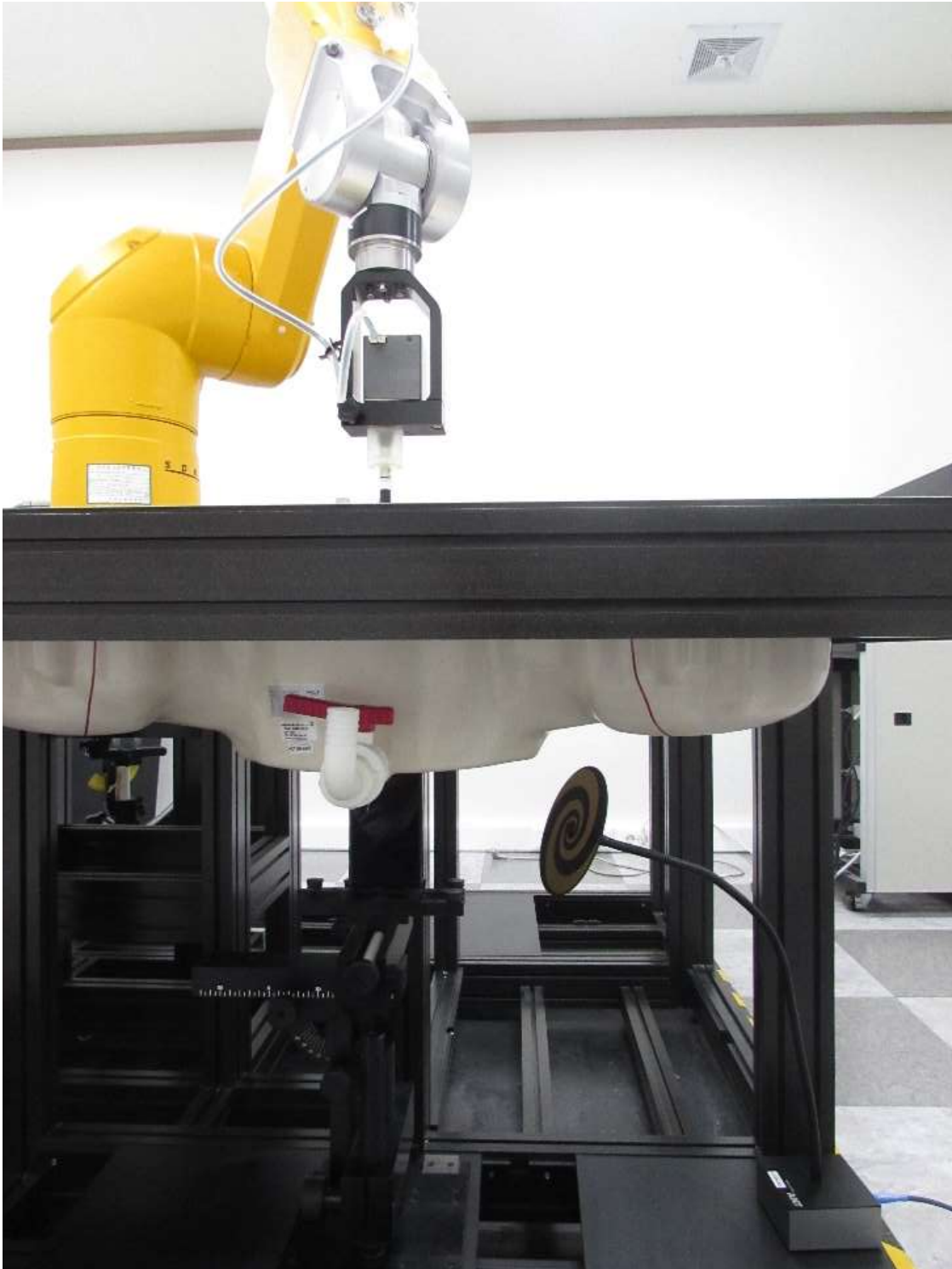
Test setup photo-4 (Legacy Band TAS SAR)