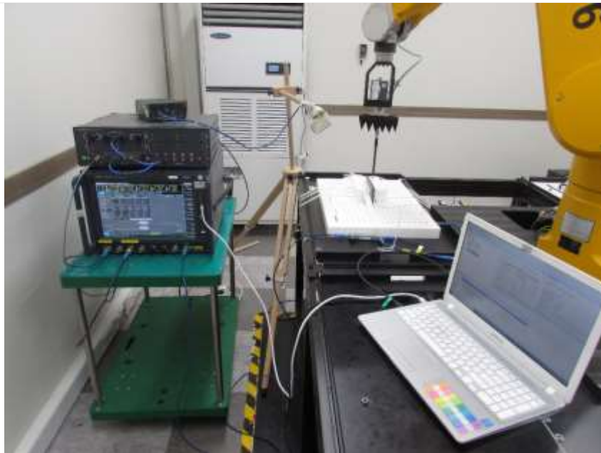
Test setup photo-7 (5G mmWave TAS PD)