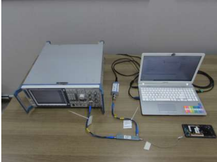
Test setup photo-1(8-1(a))