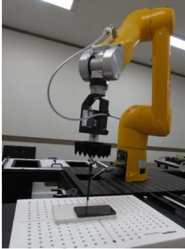
Distance of 2 mm from the EUT