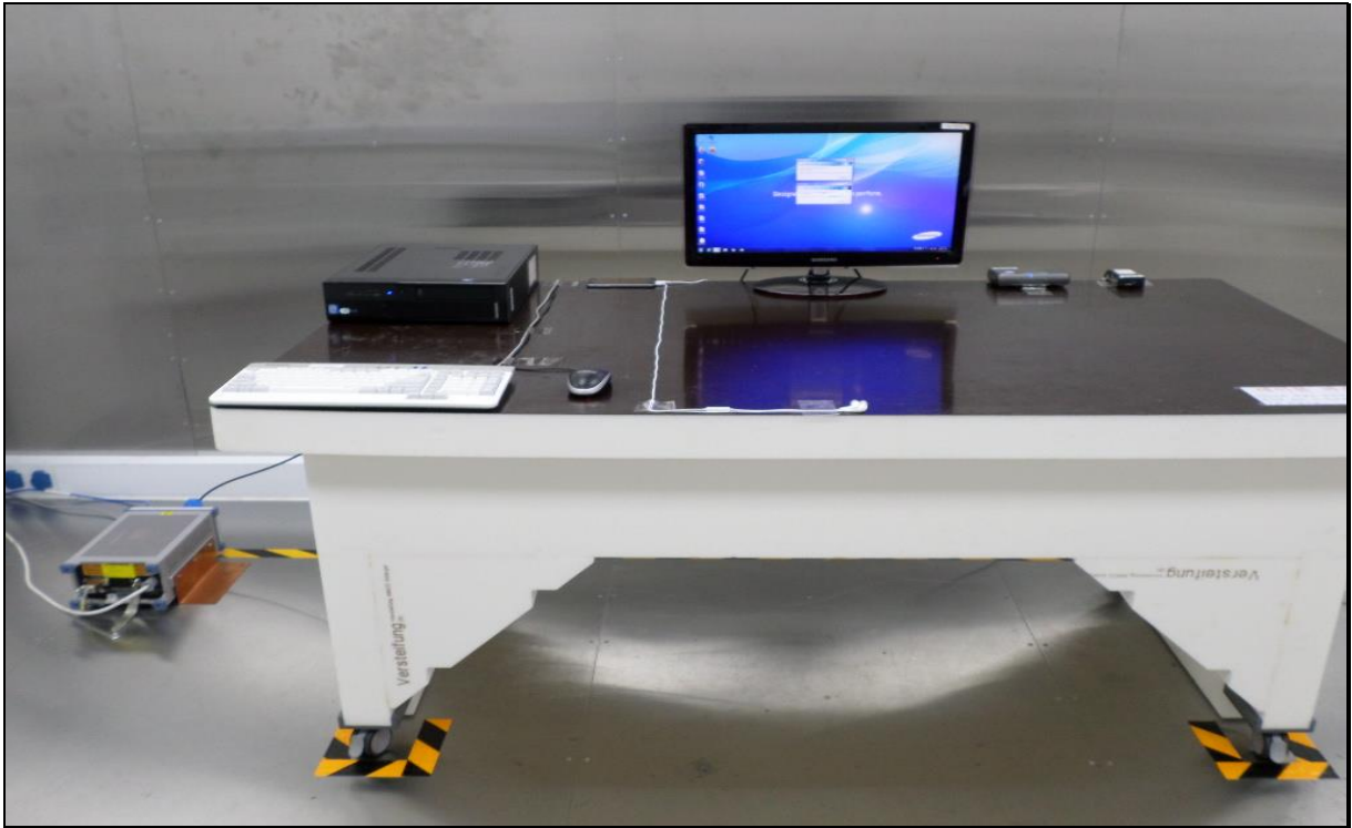
[ Conducted Disturbance – Front ]