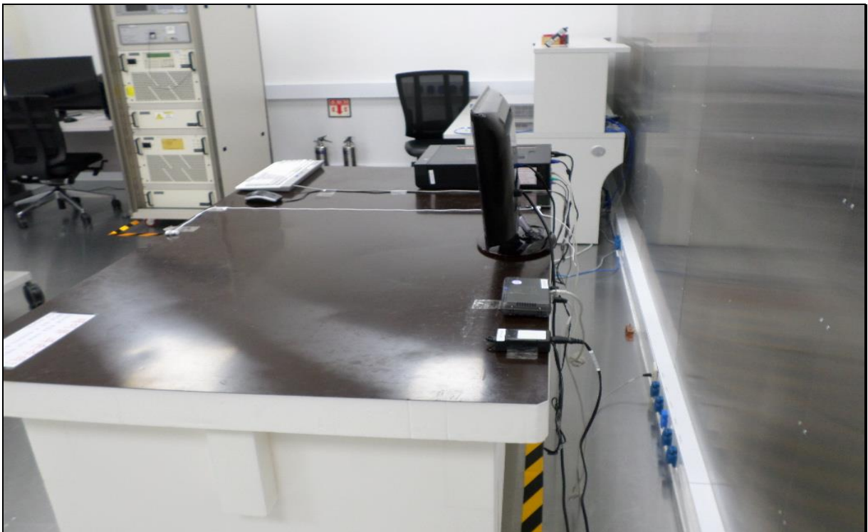
[ Conducted Disturbance – Rear ]