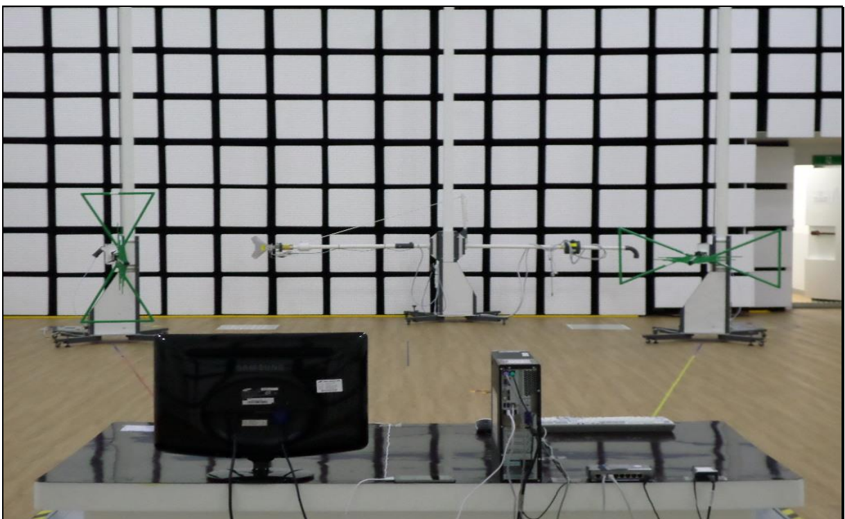
[ Radiated Disturbance for Below 1 GHz – Rear ]