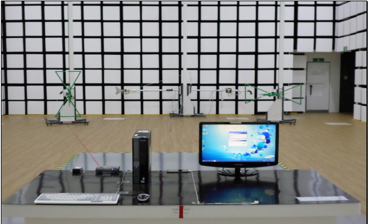
[ Radiated Disturbance for Below 1 GHz – Front ]