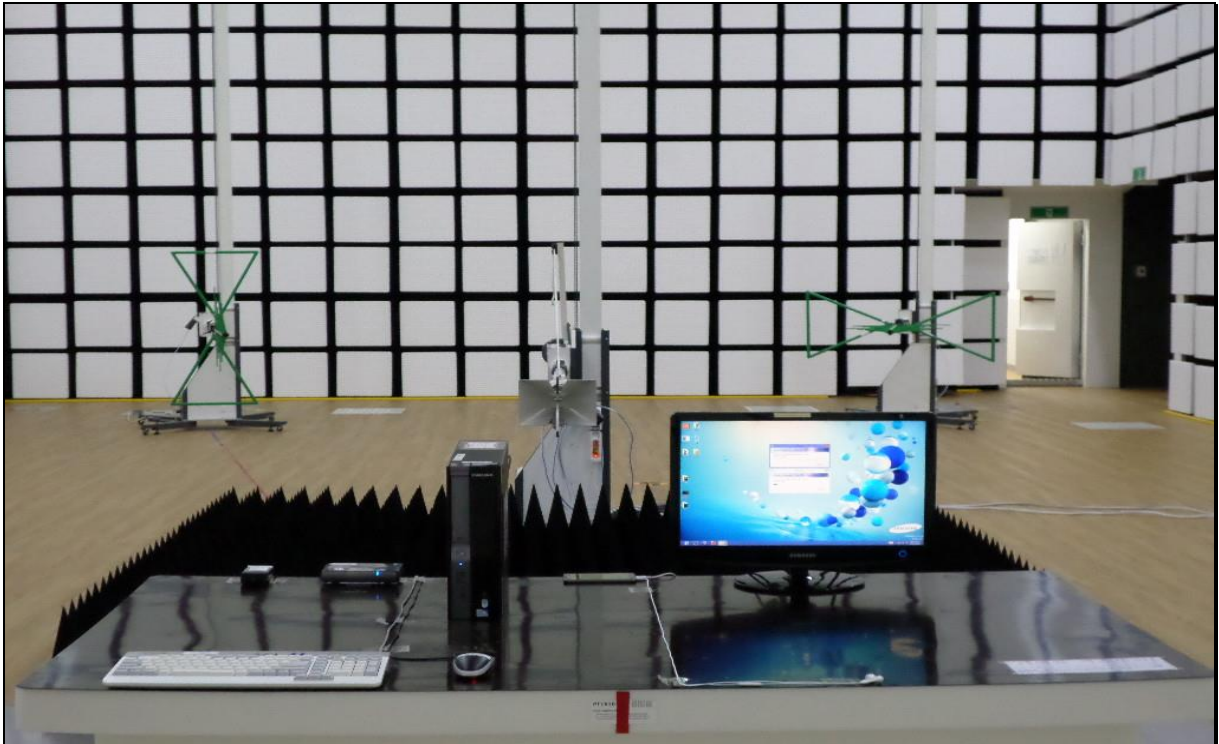
[ Radiated Disturbance for Above 1 GHz – Front ]