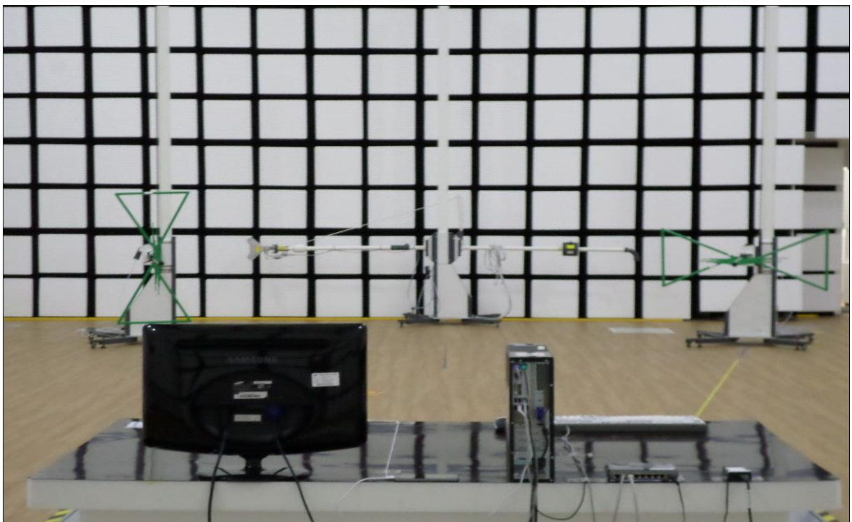
[ Radiated Disturbance for Below 1 GHz – Rear ]