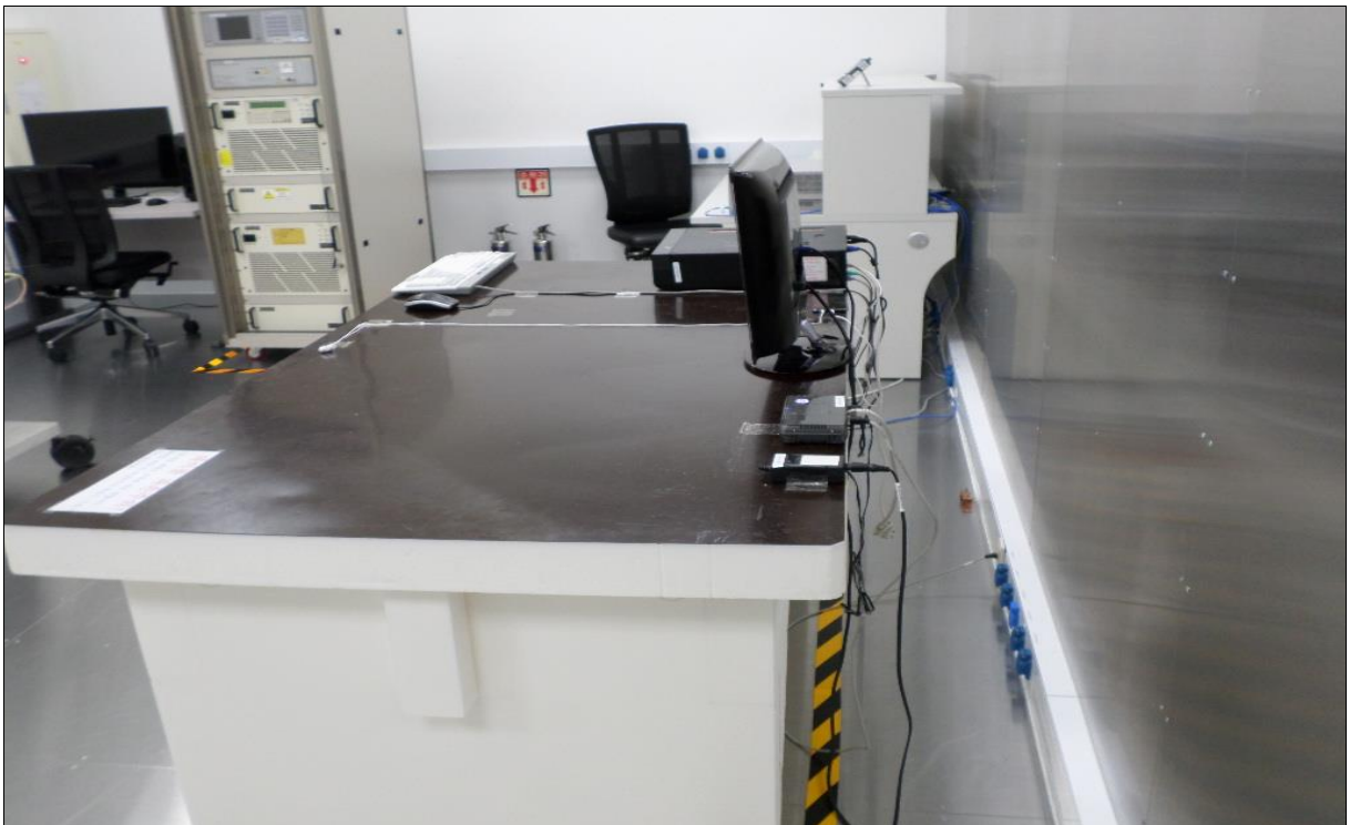
[ Conducted Disturbance – Rear ]