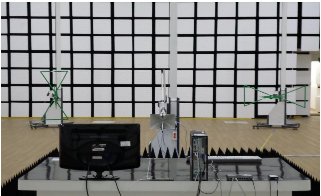
[ Radiated Disturbance for Above 1 GHz – Rear ]