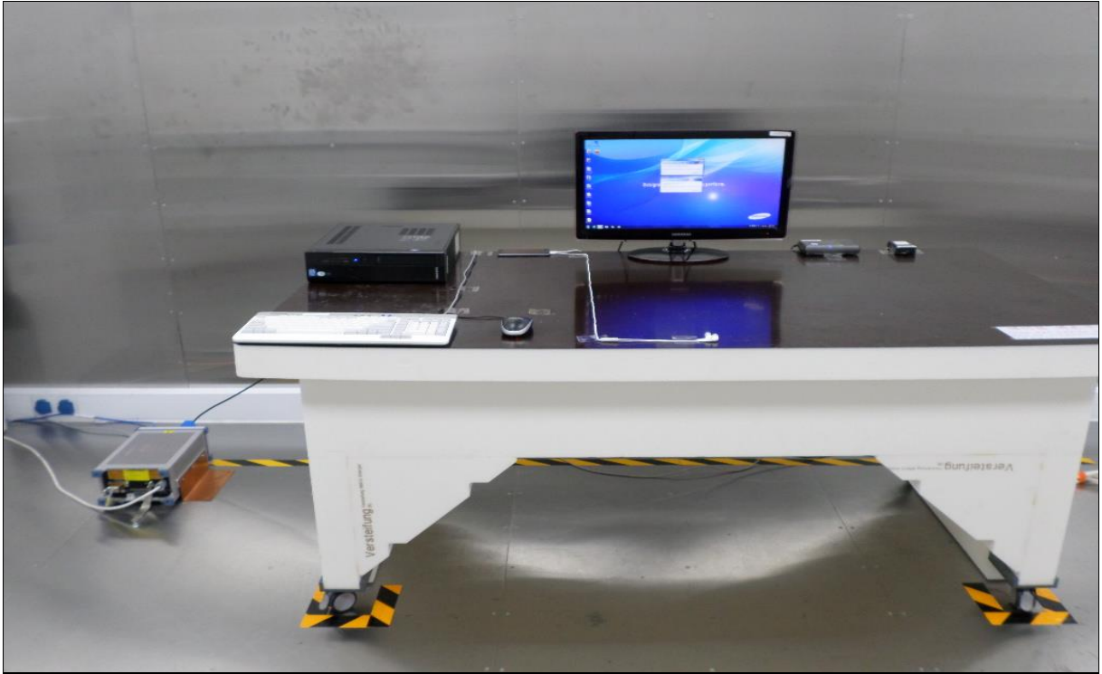
[ Conducted Disturbance – Front ]