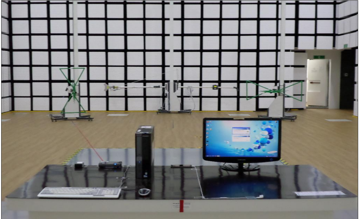
[ Radiated Disturbance for Below 1 GHz – Front ]