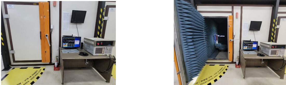
Figure 1: Testing with network analyzer

The VSWR measurement of antennas assembled into a fully operating SM-A155M/DSN Phone is measured on the Network Analyzer. The Phone is set up with a 50 Ohm coaxial cable connected to the 50 Ohm point. Calibration is done at the end of the 50 Ohm coaxial cable connection. The other end of the 50 Ohm coaxial cable is connected to a network analyzer. The phone is positioned on a non-conductive table for free space measurements.