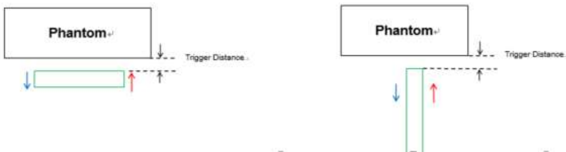
Proximity Sensor Trigger Distance Assessment KDB 616217 D04§6.2

For detailed measurement conducted power results, please refer to the Section .11