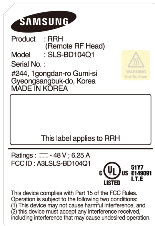
Figure 2. Label Location