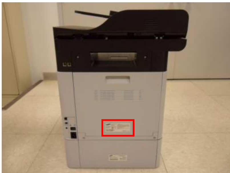
Rear View & Label Location