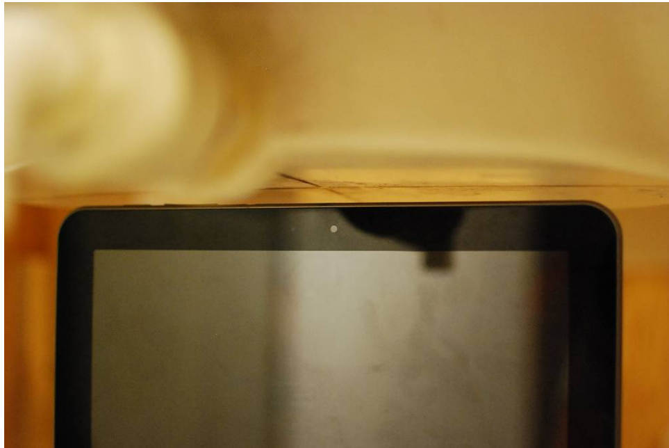
SAR Test Setup Photo 4: Top at 0.5 cm