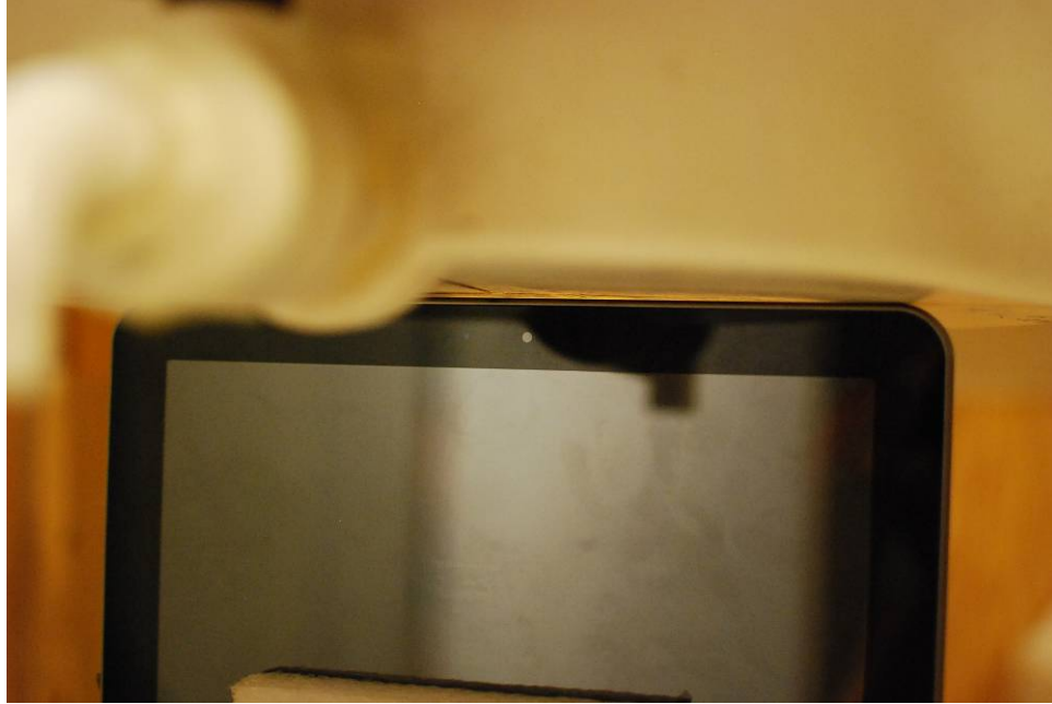
SAR Test Setup Photo 3: Top at 0.0 cm