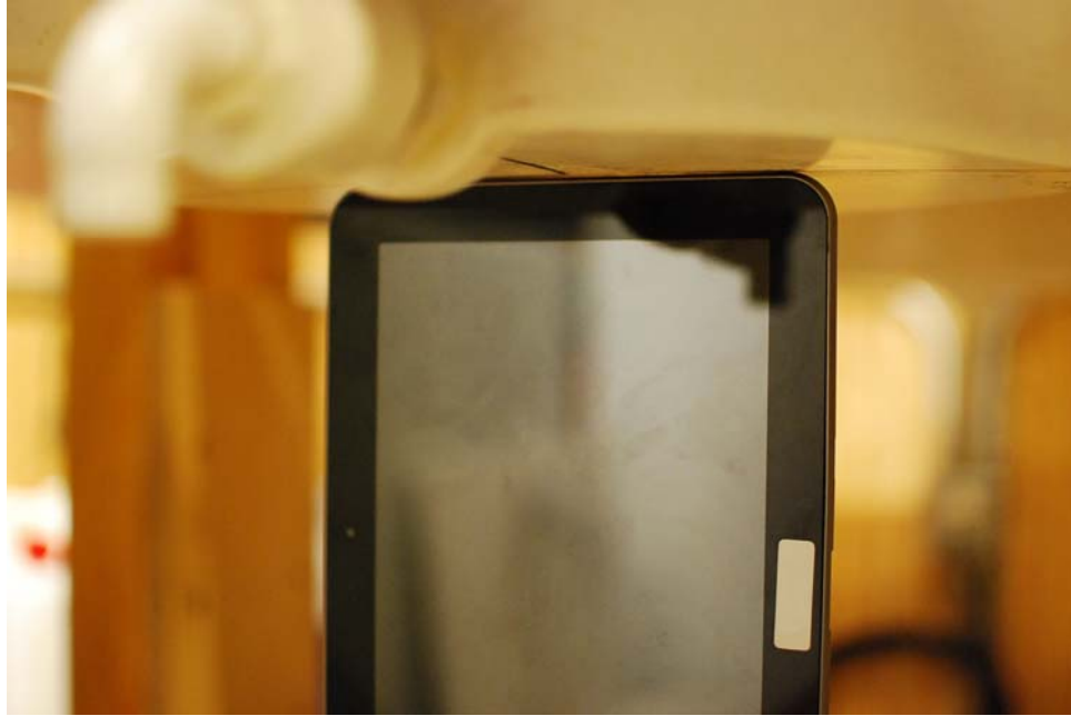
SAR Test Setup Photo 5: Right at 0.0 cm