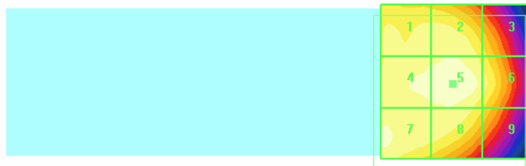
WCDMA Cellular E-field – Max 42.8 V/m (M4)