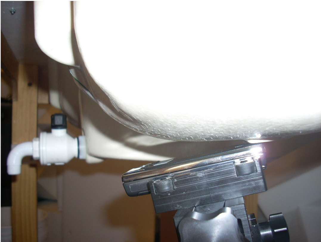
Figure 8 Left Tilt Slide In