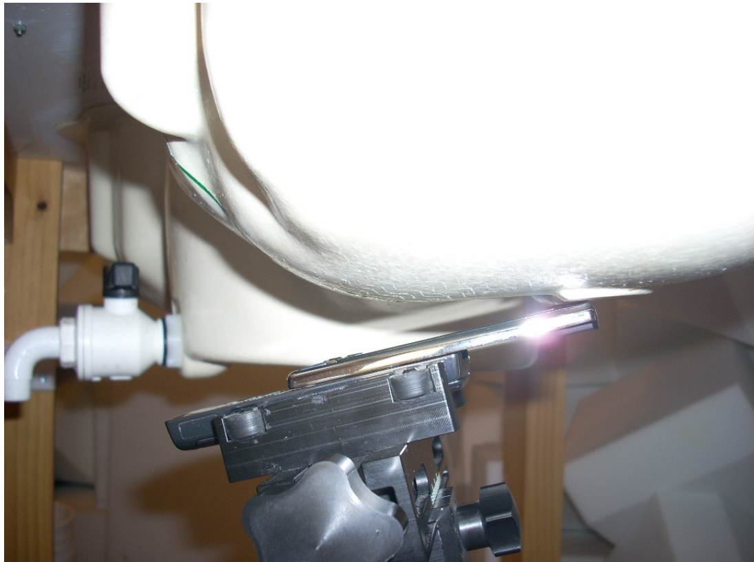
Figure 10 Left Tilt Slide Out