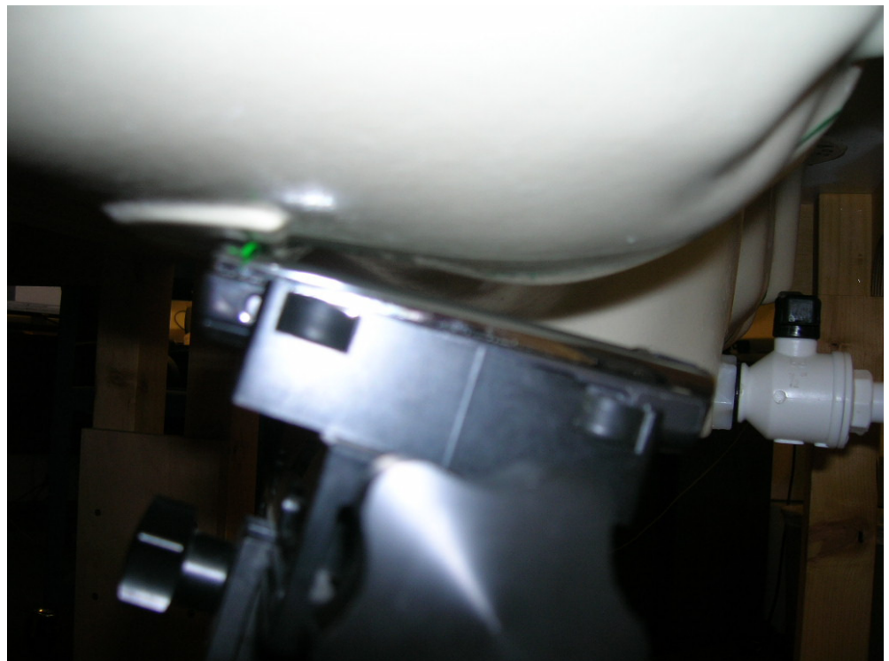
Figure 4 Right Tilt Slide In