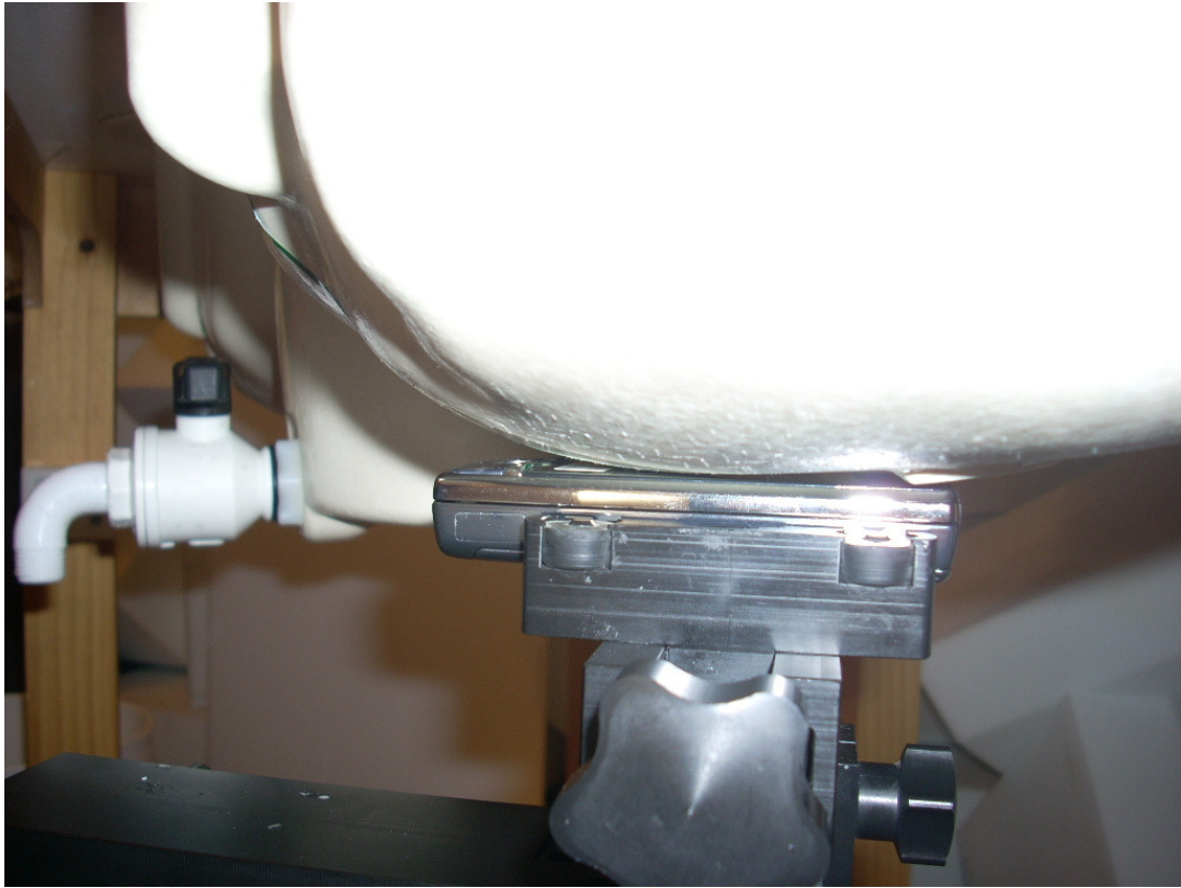
Figure 7 Left Touch Slide In