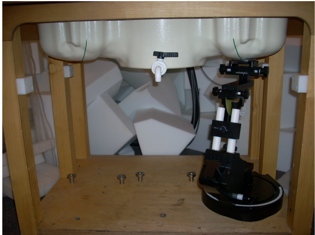
Figure 2 Left Head SAR