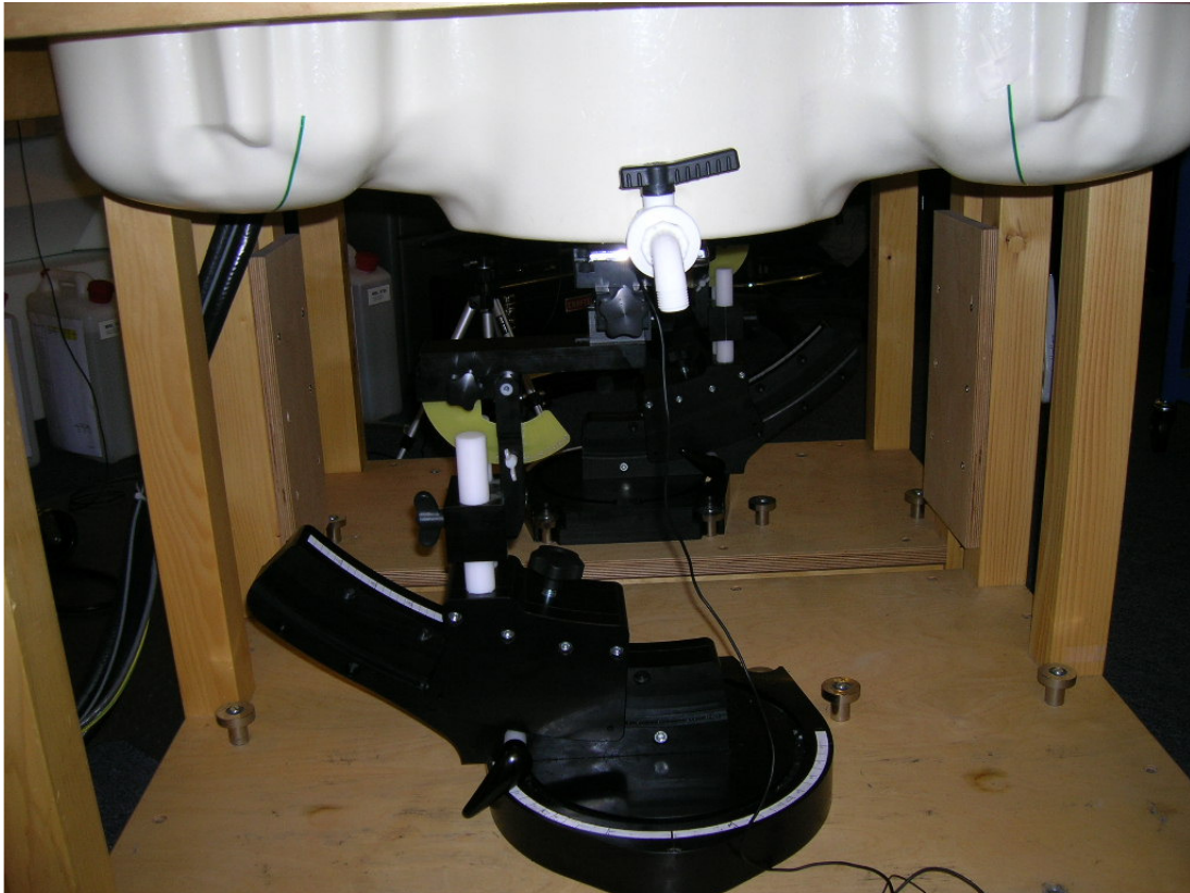
Figure 11 Body SAR