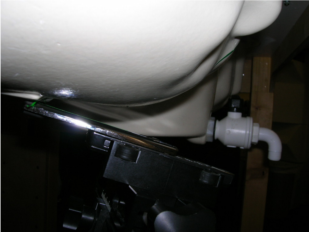
Figure 6 Right Tilt Slide Out