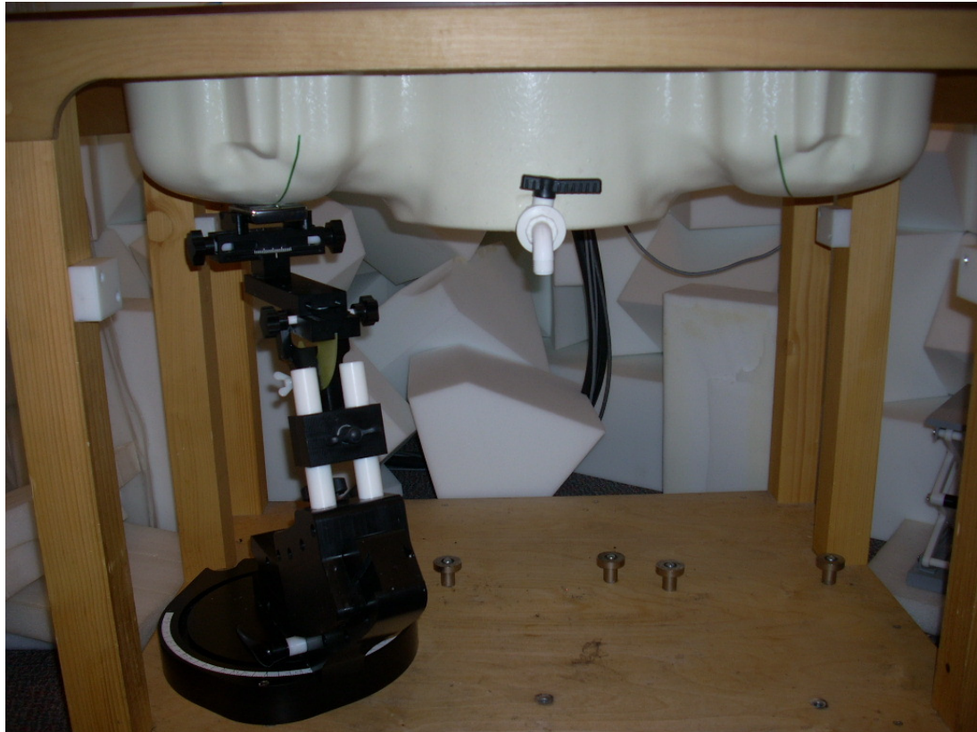
Figure 1 Right Head SAR