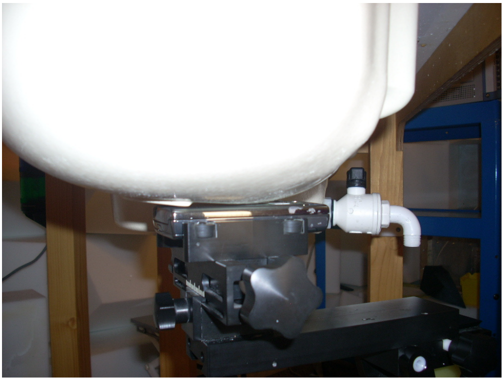
Figure 3 Right Cheek Slide In