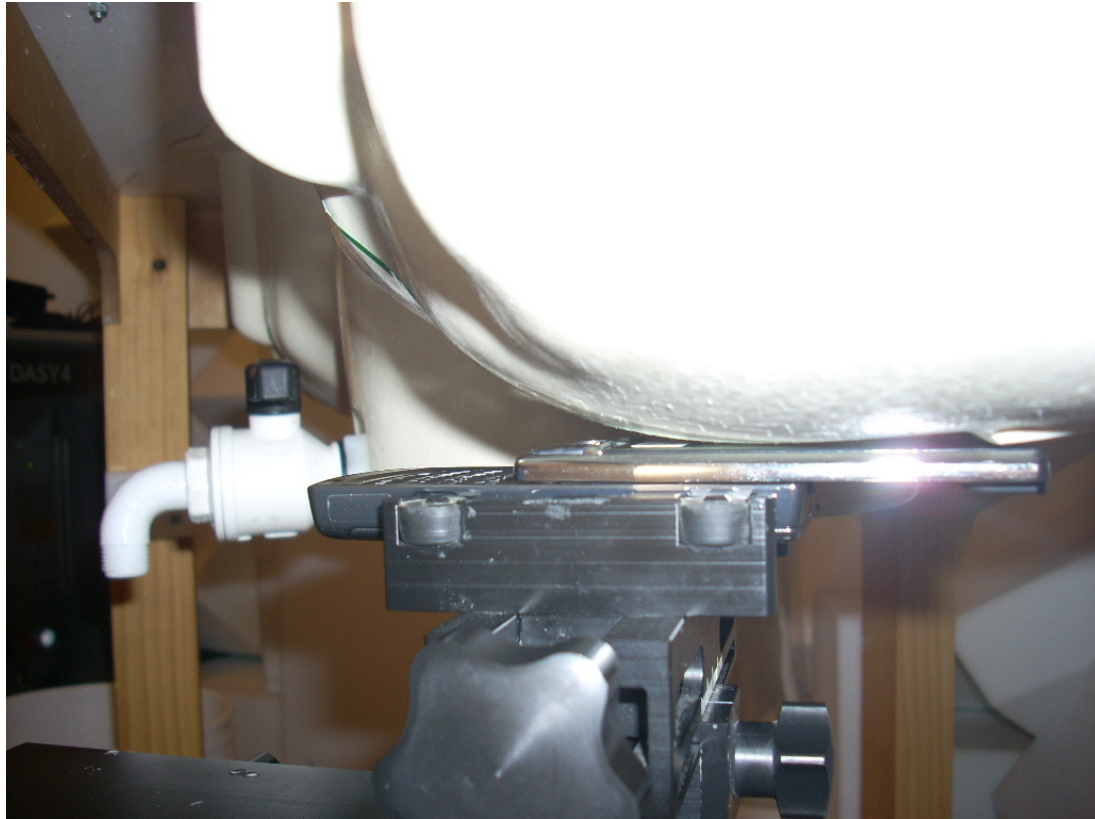
Figure 9 Left Touch Slide Out