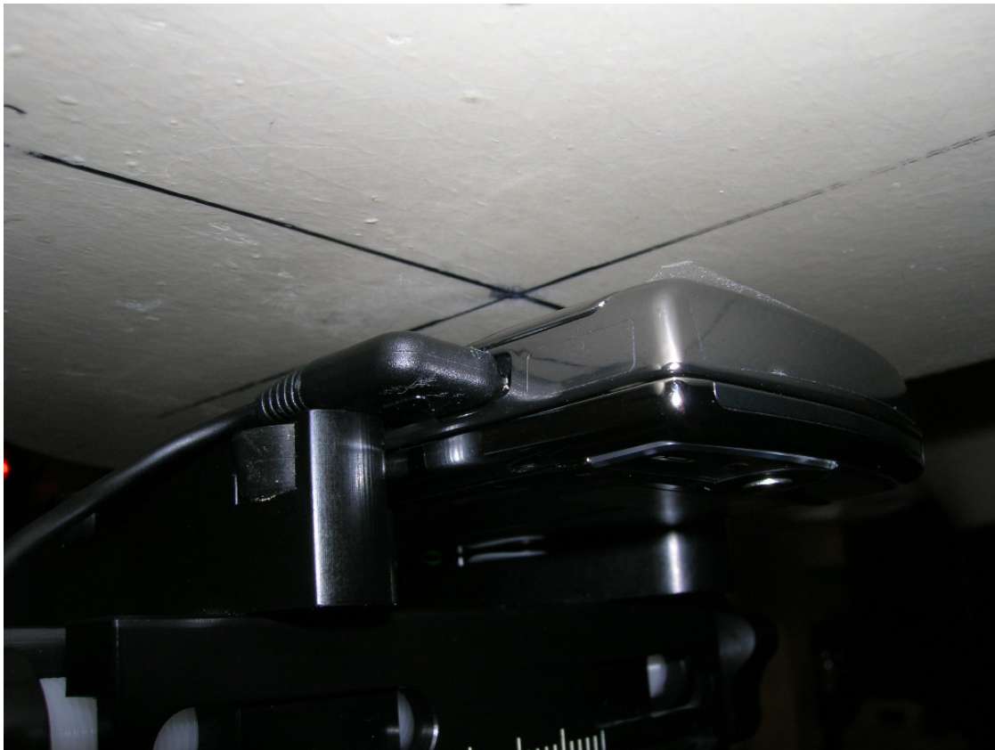
Figure 12 Body SAR with 1.5 cm spacing