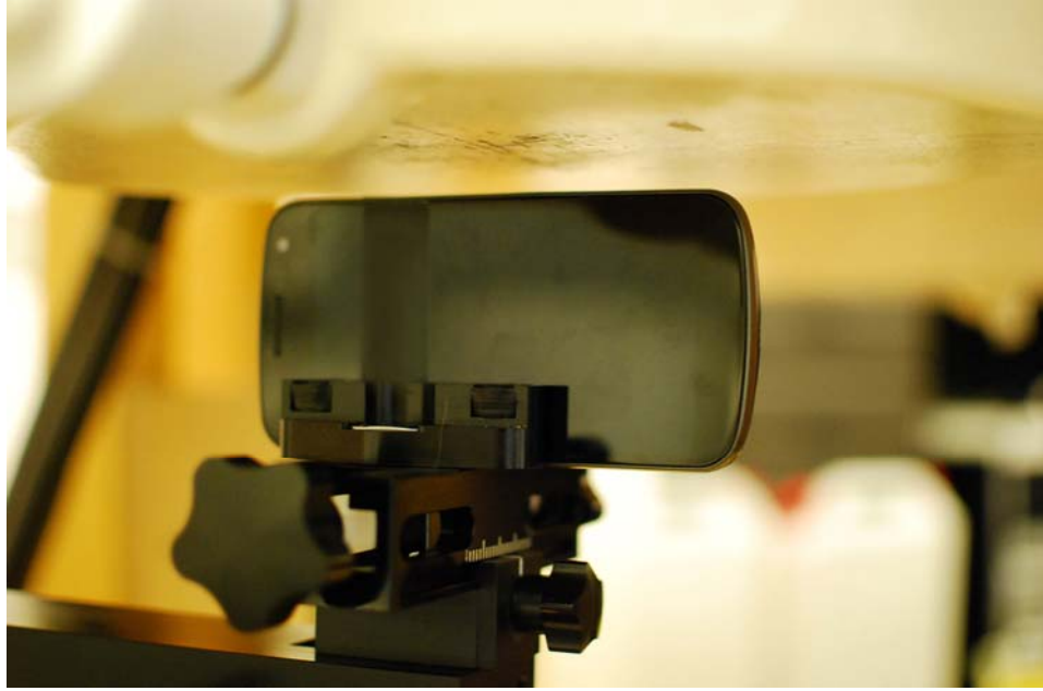
SAR Test Setup Photo 9 – Right at 1.0 cm