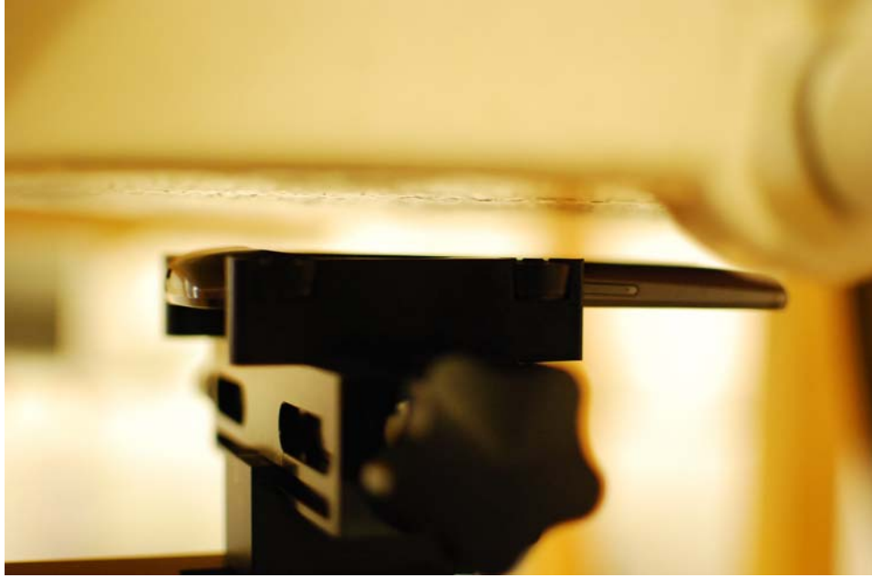
SAR Test Setup Photo 5 – Back at 1.0 cm