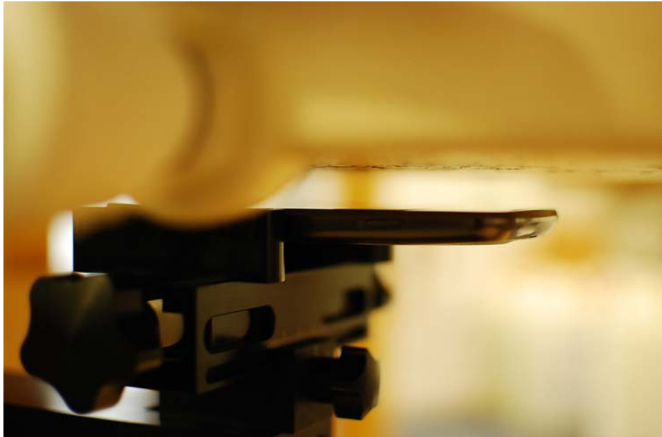
SAR Test Setup Photo 6 – Front at 1.0 cm