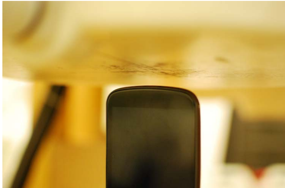
SAR Test Setup Photo 8 – Bottom at 1.0 cm