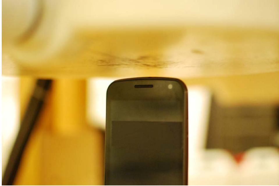
SAR Test Setup Photo 7 – Top at 1.0 cm