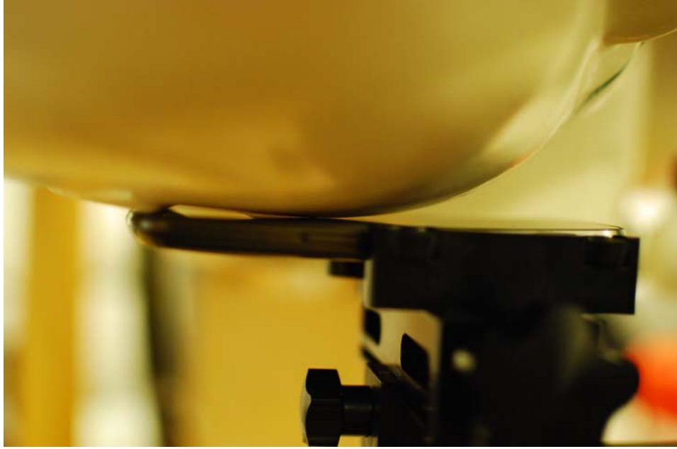
SAR Test Setup Photo 1 – Right Touch