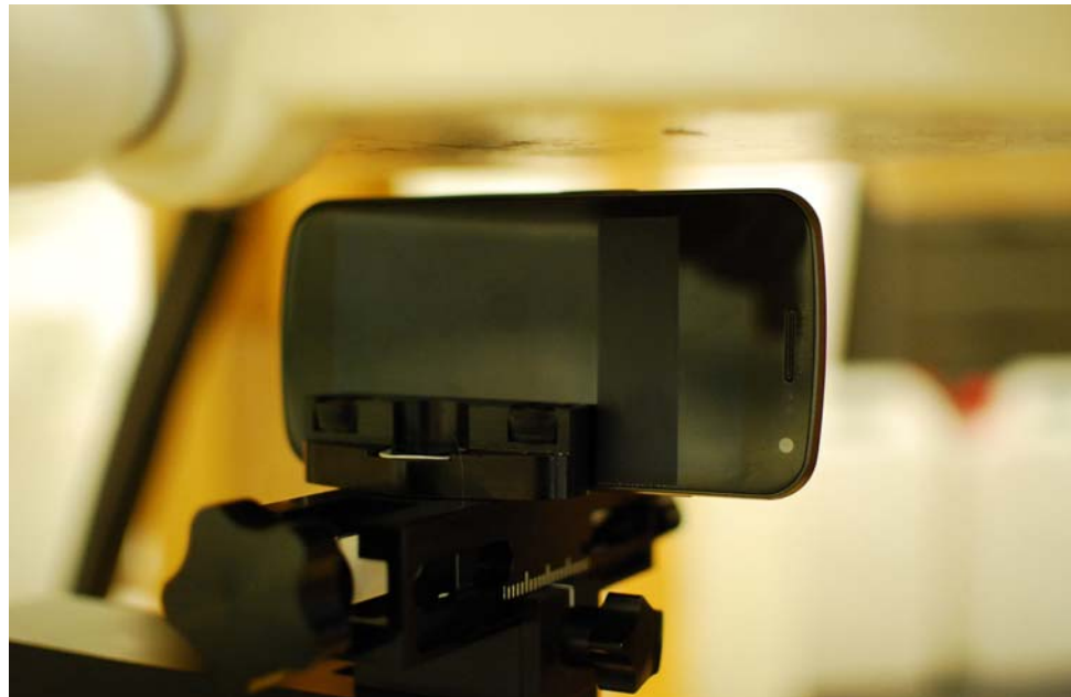
SAR Test Setup Photo 10 – Left at 1.0cm