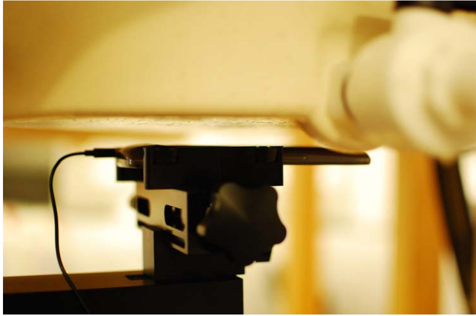
SAR Test Setup Photo 11 – Body-Worn at 1.0 cm

Note: Headset Cable is connected to the device during Body-Worn SAR assessment, as seen above.