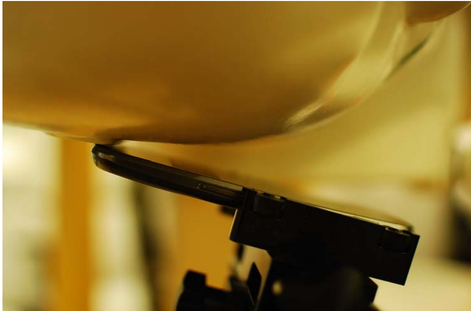
SAR Test Setup Photo 2 – Right Tilt