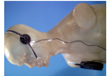
Figure 12. Shirt Pocket Configuration

The shirt pocket configuration is used for devices designed to be body-worn, and small enough to be placed inside a shirt pocket. To simulate the worst-case configuration, the EUT is placed in a torso position on the phantom with the keypad facing away from the phantom, and the Ear-Microphone wire connected to the phone to simulate hands-free operation in a shirt-pocket configuration (see Figure 12).