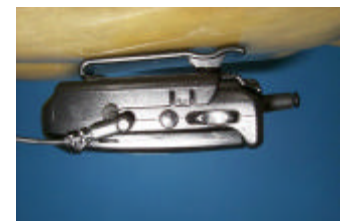
Figure 13. Body Holster Configuration

For this test the EUT is placed into the holster and the holster is positioned against the torso of the phantom in a normal operating position. The Ear-Microphone wire is then connected to the phone to simulate hands-free operation in a body holster configuration (see Figure 13).