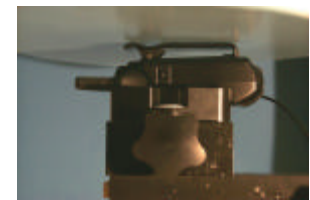
Figure 13. Body Holster Configuration

The body holster configuration is used for body-worn devices which have a body holster accessory. Typically, a holster or carrying case is provided or available as an accessory item for supporting headset and body-worn operations. SAR may vary depending on the body separation distance provided by the type of holster and batteries supplied for a phone. In most cases, the antenna may become closer to the user's body than next to the head. The design of the holster permits the phone to be positioned only with the keypad facing away from the phantom. Proper usage of the holster restricts the antenna to a specified distance away from the surface of the body. For this test the EUT is placed into the holster and the holster is positioned against the torso of the phantom in a normal operating position. The Ear-Microphone wire is then connected to the phone to simulate hands-free operation in a body holster configuration. (see figure 13)