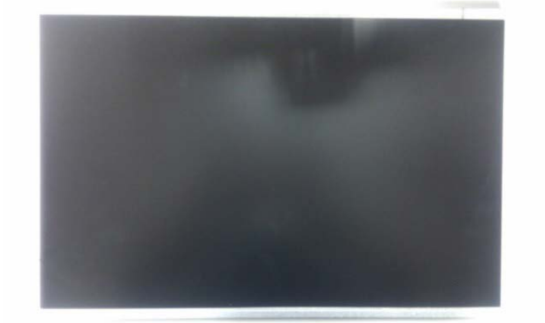
LTM215HT05 front view