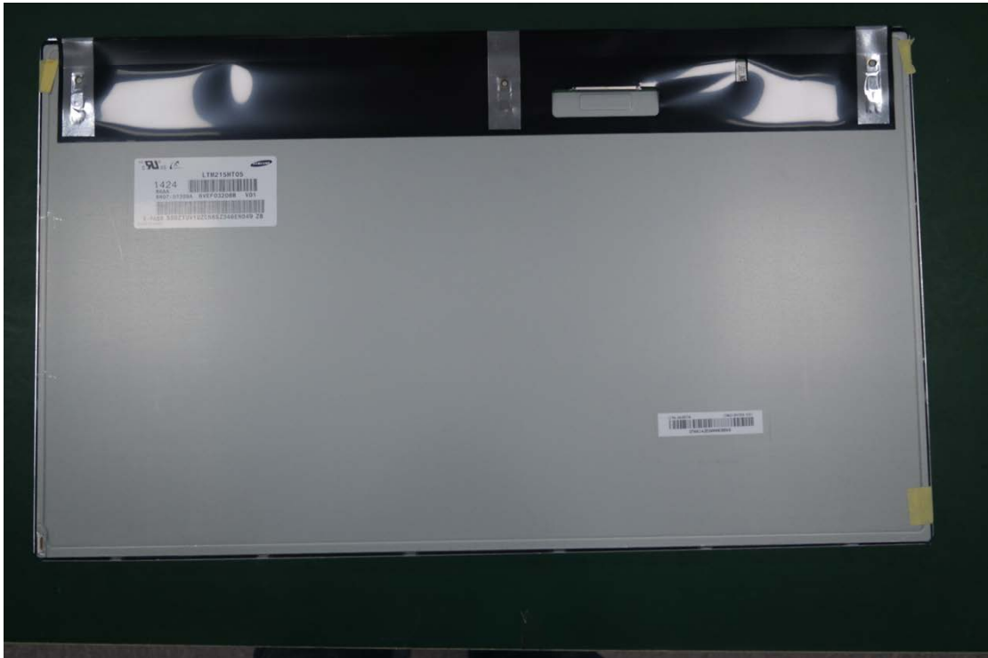
LTM215HT05 rear view