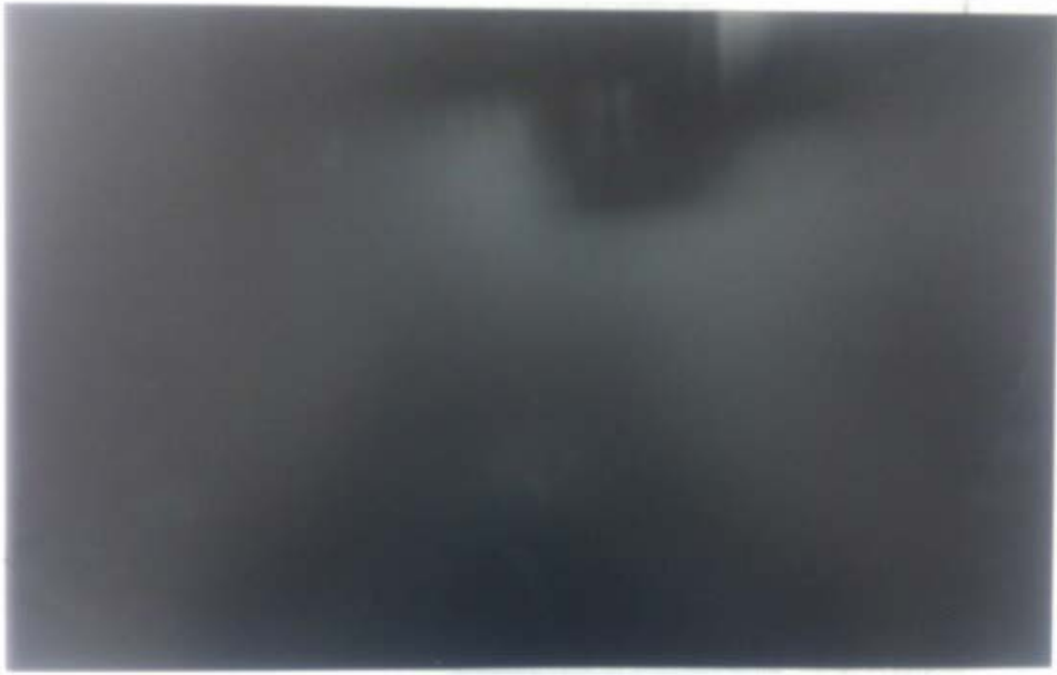
M215HTN01.1 front view