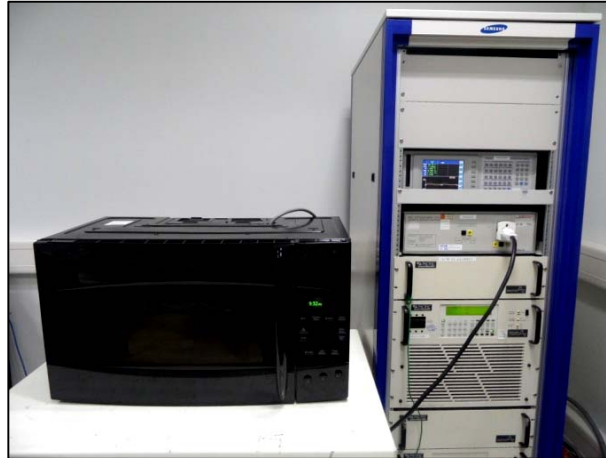
Fig.3 Test Setup for RF output power

The Caloric Method was used to determine maximum output power. The initial temperature of a 1000-ml water load was measured. The water load was placed in the center of the oven. The oven was operated at maximum output power for 120 seconds. Then the temperature of the water re-measured.